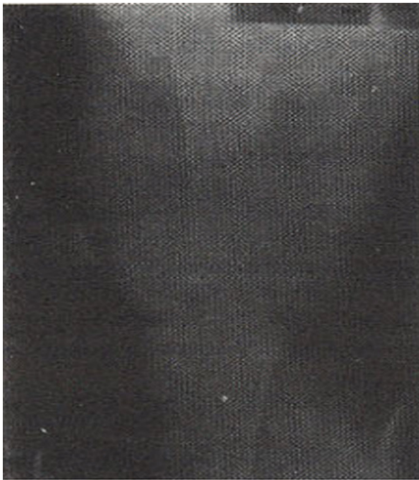
Figure 1. AP view of left Knee.