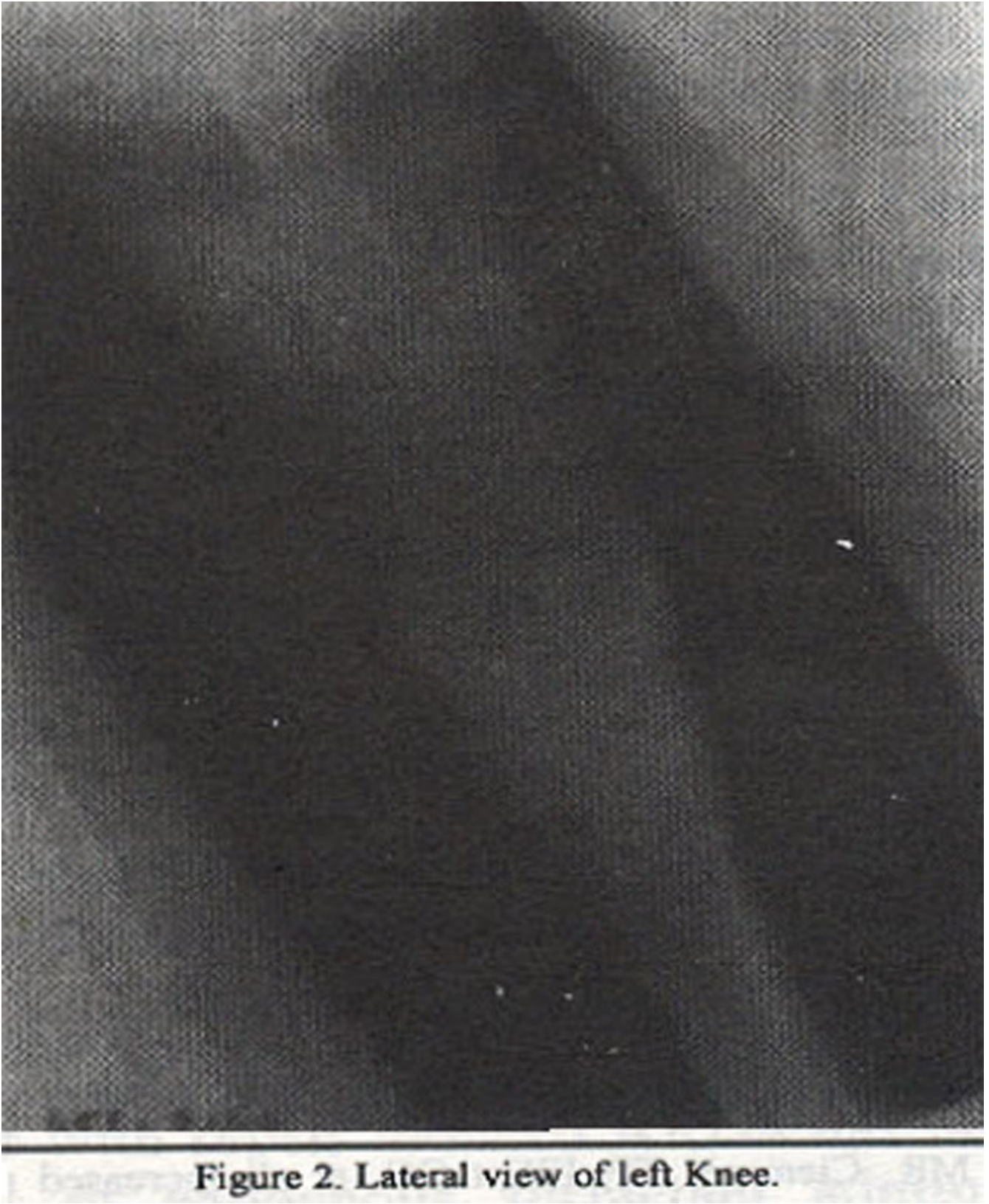
Figure 2. Lateral view of left Knee.

Diagnosis: Salter-Harris Type-II fracture.