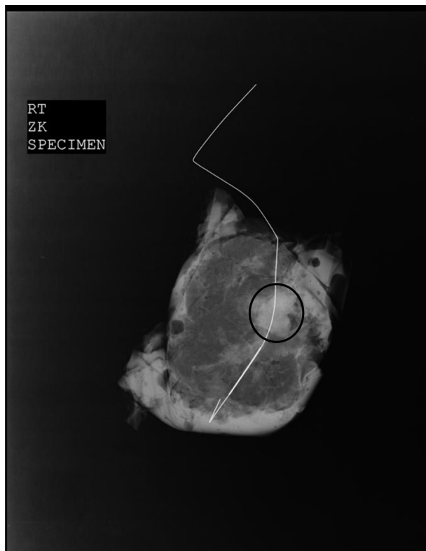
Figure 2 Magnified view of excised breast specimen showing the localized soft tissue density nodule (Black Circle) with Kopian's wire in situ.