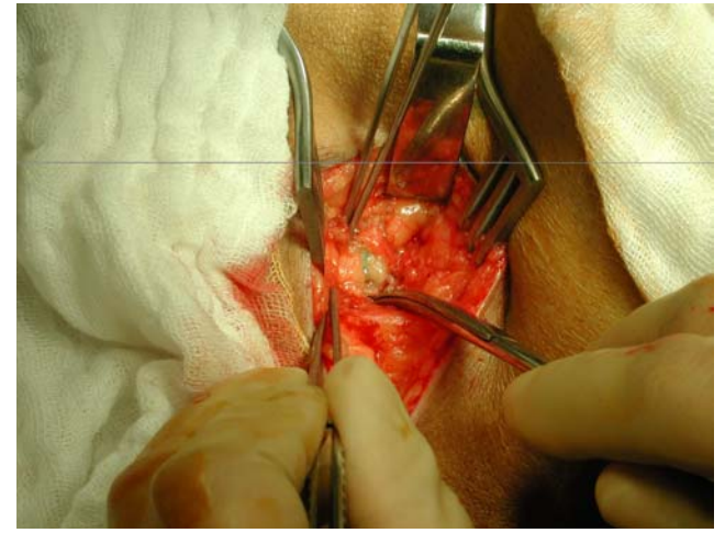
Figure 2. Sentinel lymph node containing blue dye explored per-operatively.

histopathology report was available. All removed material was checked in operating room for radioactivity before sending it for pathologic examination.