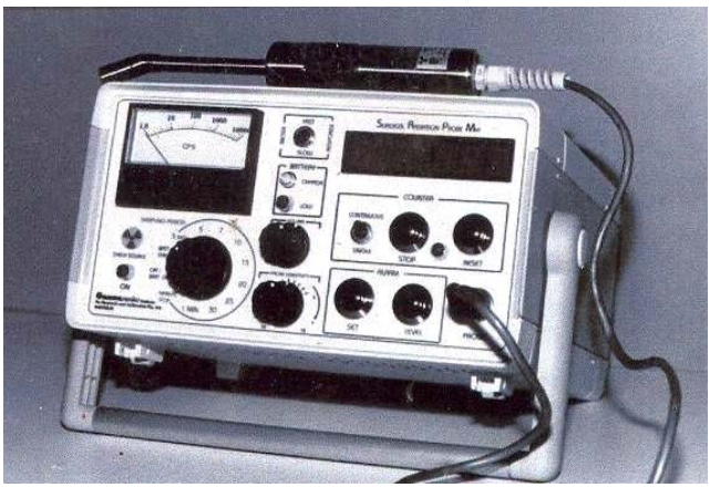
Figure 1. Gamma ray detecting probe.

After the primary tumor had been removed, the gamma probe (in a sterile glove) was used to precisely locate the skin projection of the node emitting the greatest radioactivity, using the skin mark as a guide. The skin was incised directly over this point and using the gamma probe to guide dissection. The node emitting the highest activity was placed in the container labeled as sentinel lymph node. This was followed by complete axillary dissection in 28 patients. In 4 patients simultaneous axillary dissection was not performed as these patients decided to defer it till