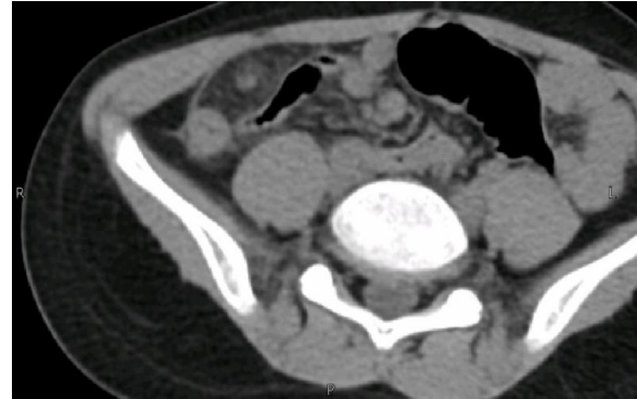
Figure-2: Axial section from right iliac fossa showing focal fat stranding in right iliac fossa with surrounding peritoneal enhancement and central hyper dense focus.

Non contrast CT scan of abdomen was then performed which showed a well-defined area of focal fat stranding between anterior abdominal wall and colon in right iliac fossa. There was surrounding peritoneal thickening and a high attenuation focus in the center of this area; likely representing a thrombosed vessel. It was correlating with findings of ultrasound examination in terms of size and location. Hence, a provisional diagnosis of omental infarction was made. (Figure-2) Since the inflammatory changes around this region were also encompassing appendix on CT examination, the surgical team opted for exploration. Findings of omental infarction were confirmed on laparotomy. Post operatively, patient had an uneventful recovery and was discharged from hospital on third post-operative day.