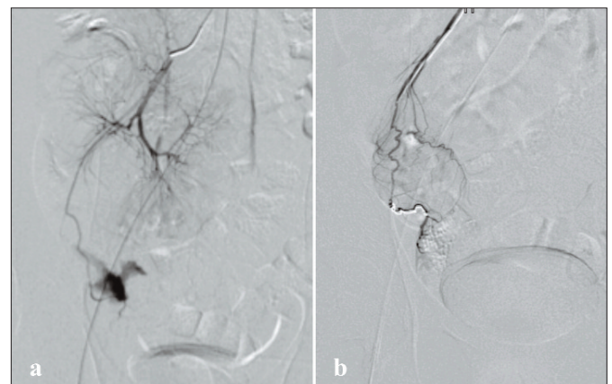
Figure 1: (a) Selective angiogram of ileocolic artery demonstrated profuse bleeding from an aberrant branch of SMA. (b) The vessel was super selectively cannulated and embolized with two pushable platinum coils.

On admission, the patient's blood pressure was 100/60 mm Hg, haemoglobin level was 8.9 g/dl and hematocrit was 21%. On examination, he had painless per rectal bleeding. Episodes of bleeding continued over next 3 days of admission and a total of 8 units of packed red cells were administered. He bled profusely on the third day and was shifted to the special care unit. His urgent RBC-tagged radionuclide scan was performed which showed abnormal focus of bleeding in the pelvis (Figure 1a). His mesenteric angiogram was performed which showed profuse active extravasation of contrast from an abnormal end artery arising from ileocolic branch of superior mesenteric artery. The bleeding vessel was successfully embolized with micro-coils. Due to the abnormal location and course of the vessel, it appeared to be vitello-intestinal artery and suspicion of Meckel's diverticulum was raised (Figure 1b). His subsequent CT scan showed a blind ending intestinal pouch with enhancing walls in the lower mid abdomen (Figure 2a). Later on radionuclide Meckel's diverticulum scintigraphy was performed with 200 MBq Tc 99m pertechnetate, which demonstrated tracer deposition in