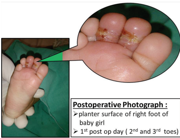
Fig. 3: Postoperative Photographs.

or contact dermatitis. Careful examination of digits for strangulation in an irritable child with digit swelling is a crucial step.