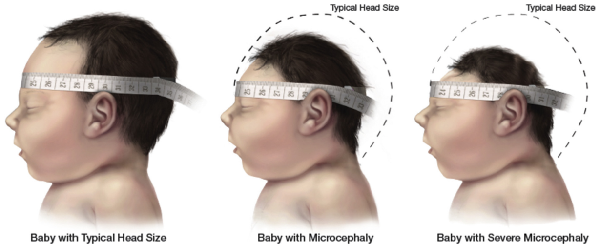
Fig. 1. Measuring Head Circumference (image reproduced from reference CDC's response to Zika [56]).