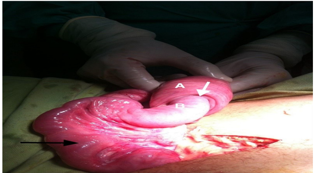
FIGURE 2: Small bowel of the patient during surgery

Small bowel during surgery showing telescoping (white arrow) of the proximal segment (marked by B) into the distal segment (marked by A). There is dilation and edema of the proximal small bowel (black arrow)