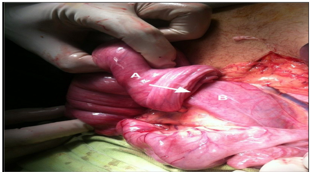
FIGURE 3: Small bowel of the patient during surgery

Small bowel during surgery showing telescoping (white arrow) of the proximal segment (marked by B) into the distal segment (marked by A). There is dilation and edema of the proximal small bowel (black arrow)