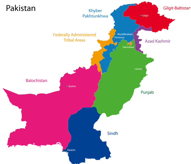
Figure 1. Map of Pakistan, Provinces and Federally Administered Territories.

Keeping in view the gaps in information, we analyzed the most recent PDHS 2012-2013, to determine the factors that affect ANC utilization in Pakistan. We utilized adapted Anderson's model for healthcare utilization (a well-studied and tested