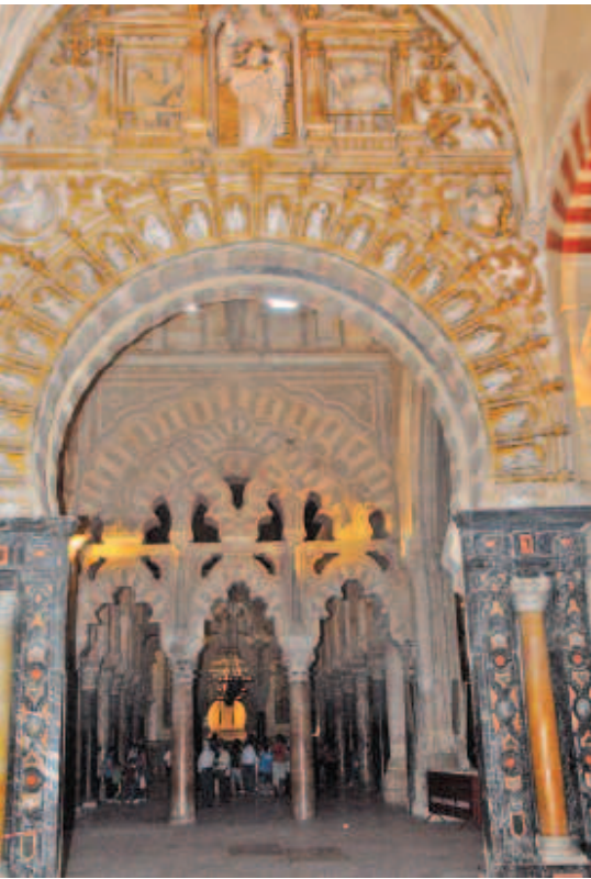
Church and the Mosque of Cordoba

consecrated the mosque as a cathedral and a weather vane called Giralda was placed on the bell tower. Sadly, the mosque, despite all its grandeur and magnificent façade is simple called La Giralda. The Alcazar was later turned into the residence of King Peter the Cruel who hired Muslim artisans to embellish it with designs and inscriptions from the Quran.