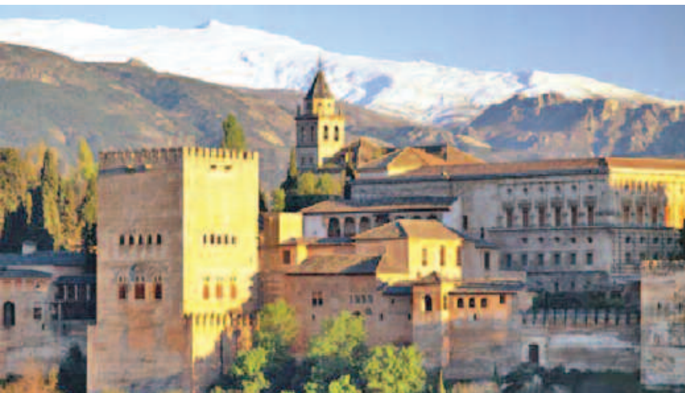
Calat Alhambra (Arabic: الحمراء القلعة Trans, al-Qal'at al-Hamra , the red fortress)

Seville (also: Ishbiliya) is the third important city on the trail of Muslim history. Fame and glory came to Seville much later in Muslim history. Muslims lost Toledo to Alphonso II in 1085 and the panicked Muslim rulers invited Berbers from Morocco to come to their help. The Almoravids came across the Straits of Gibraltar like locusts, and after defeating the Christians settled in Seville. Sixty years later another Berber tribe of extremist Islamists much like the Taliban of today wrested power from the Berbers. However the most enduring monuments of Almohad rule are the magnificent mosque of Seville and the palace of Alcazar built for the ruling Emir. King Ferdinand