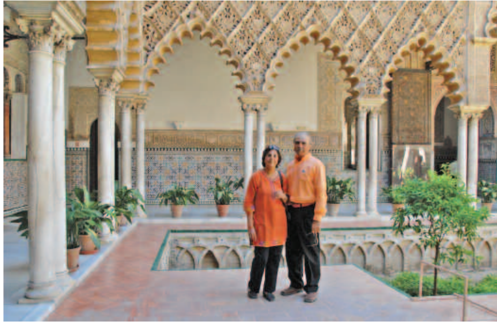
The Alcazar, Seville

an architectural wonder embellished with intricate designs woven into Arabic calligraphy was built not during the zenith, but in the fading days of Al Andalus. In 1492, Muslims ignominiously handed over Al-Hambra to the perfidious King Ferdinand and Queen Isabella who declared it their new home and chapel. Beyond Al-Hambra there is no remembrance in the city of Granada to evoke Muslim background. In Spain, travelling by train is most convenient and inexpensive if you are not in a rush. Fast trains are expensive but cut down the travel time enough to take day trips from Toledo to Granada and Cordoba.