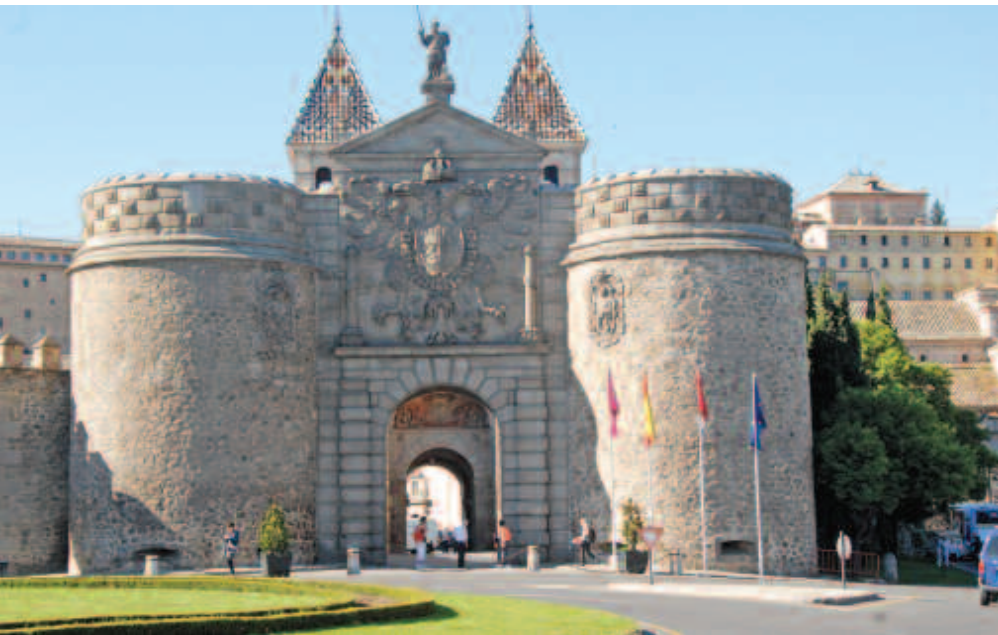
The Toledo gate where Tariq entered

The April of 2010 was a disastrous time for travellers. The largest volcano in Iceland, Eyjaffjallajokull, made Europe a no-go destination. The vagaries of nature forced us to alter our plans and our new destination became Spain. I knew very little about our history then, but after my visits to Jerusalem I was transformed into a student of Muslim history.