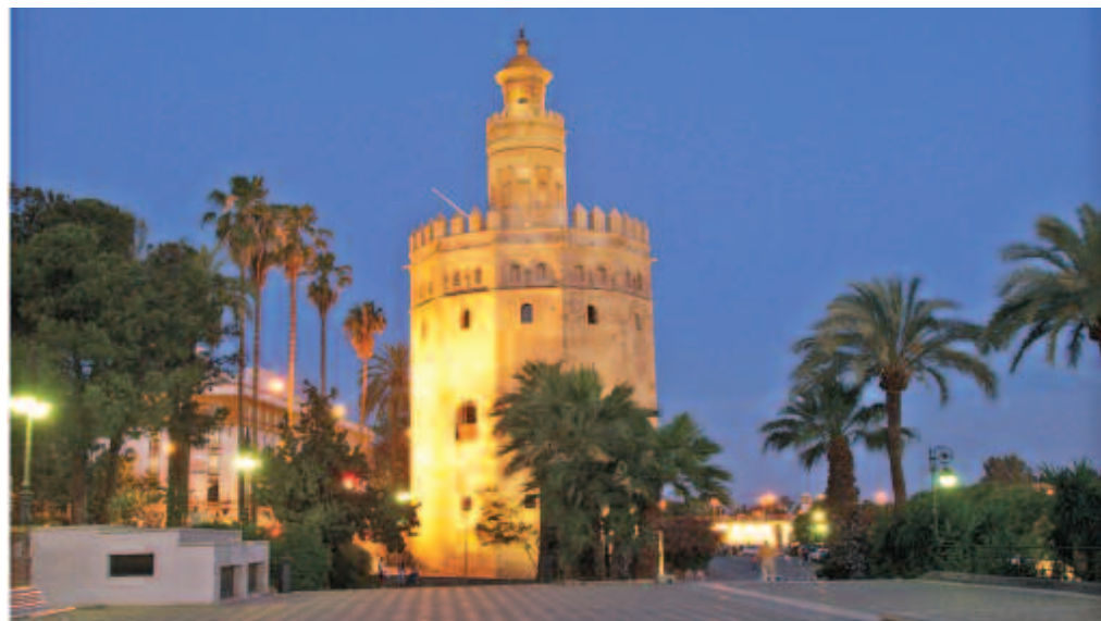
Torre del Oro made by Almohads in Seville

Granada is an all-time favourite because of its majestic Al Hambra, a Muslim palace for 240 years. Few realize that this magnificent edifice,