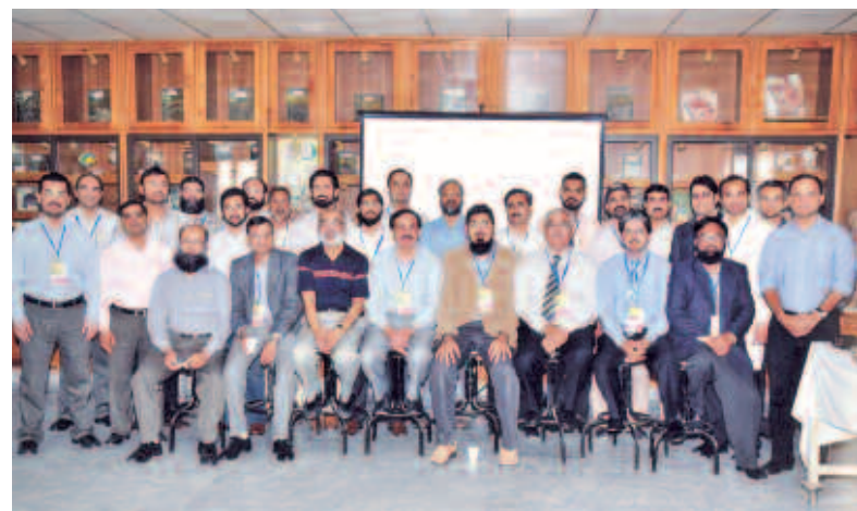
Course faculty and participants

The first day was dedicated to pelvic surgery and second to acetabular surgery. The course had 19 lectures, 8 video sessions and 7 saw bone workshops.