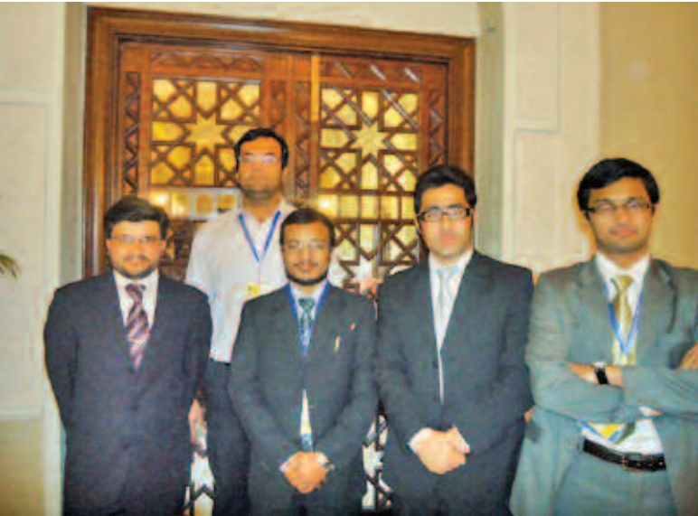
Orthopaedic residents at Orthcon 2011