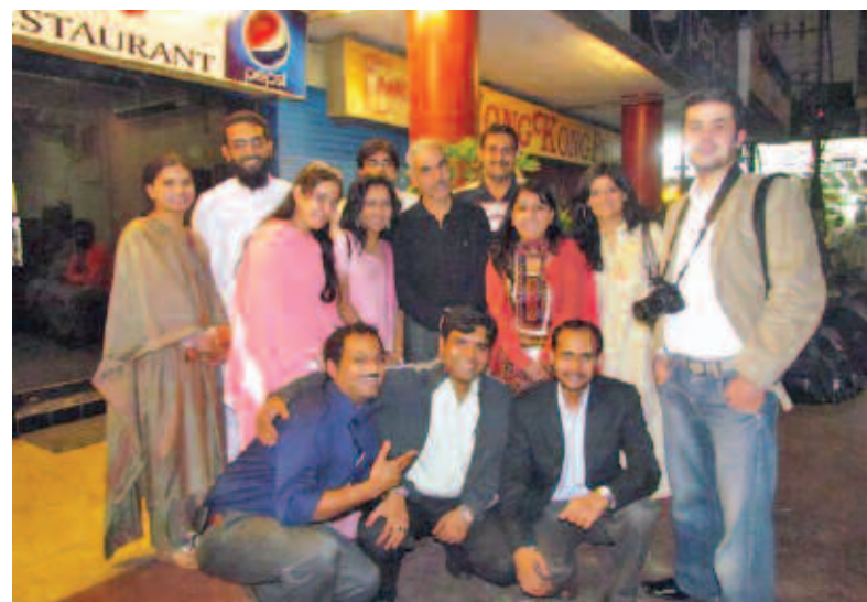
"ENT Residents' Nightout"

A lot of support and presence was provided by senior faculty members, instructors, fellows and senior residents from the Department of Surgery. In future, we are planning to hold this activity every six month in accordance with the intermediate module schedule.