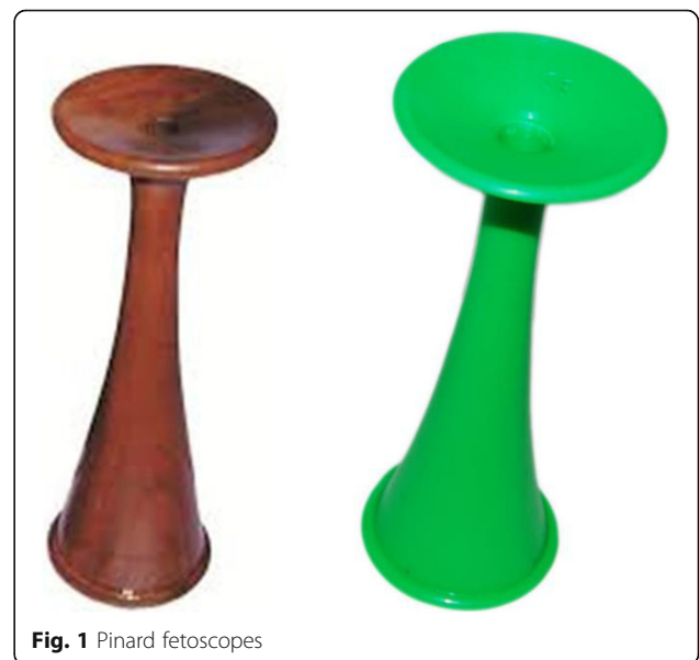
Fig. 1 Pinard fetoscopes

Fetoscope is a hollow horn, made up of wood, plastic or metal, normally about 8 in. or more. It amplifies sound similar to an ear trumpet from the fetal heart, via a bone construction to the midwife's ear (Fig. 1). Hand-held Doppler is ultrasound with a transducer used to