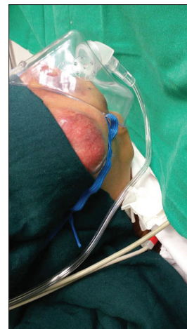
Figure 1: Large mass arising from the right cheek and upper jaw

In the preoperative assessment, there was no significant past medical and surgical history. On airway examination, there was a right cheek lesion with no mouth opening. The tumor involved both eyes and obscured right nostril completely, but the left nostril was patent. We discussed with patient, family, and surgical team about an alternative technique for procedure that does not require airway handling. We also explained awake fiberoptic intubation but its complications or failure may result in tracheostomy. We also did explain that there may be mild pain at certain step during the procedure can be treated.