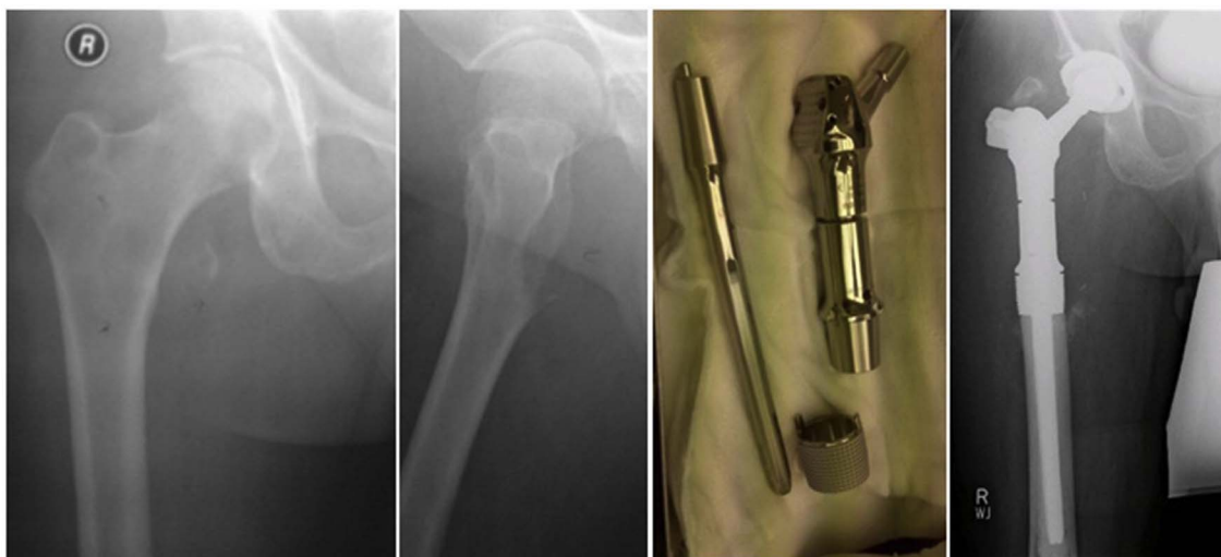
Fig. 1. Case No 1.