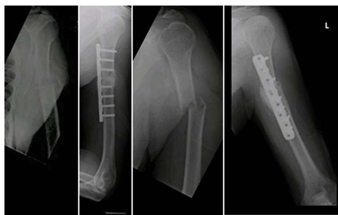
Fig. 3. Case No 3.

increasing incidence of primary lesion. Studies show 85 %of patient with metastatic RCC may experience SREs related complications in their life with a mean no. of > 2 events per patient [84]. These events increase economic burden, decrease quality of life and ultimately enhance morbidity and mortality. Overall prognosis of patient with advanced RCC is poor; this emphasizes on importance of early detection