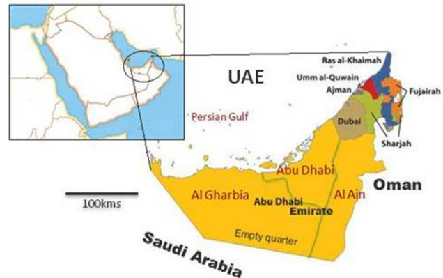
Figure 1. Al-Gharbia region, Abu Dhabi, UAE

included 585 budgeted nursing positions; 435 positions were filled, with the remainder in the process of being filled. Only one of these positions was filled by an Emirati nursing graduate. [4] The AGHS provides primary, secondary, and selective tertiary care to patients in the region. People requiring interventions for high-risk conditions are usually transferred to other hospitals in the city of Abu Dhabi.