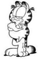
A Little Upset