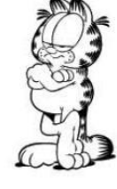
A Little Upset