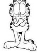
A Little Happy