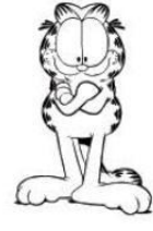
A Little Happy