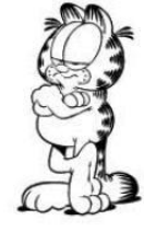
A Little Upset