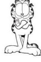
A Little Happy