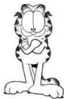
A Little Happy