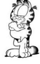
A Little Upset