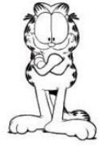
A Little Happy