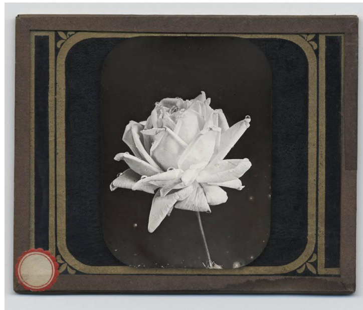
Dew drops on a rose from Penn State