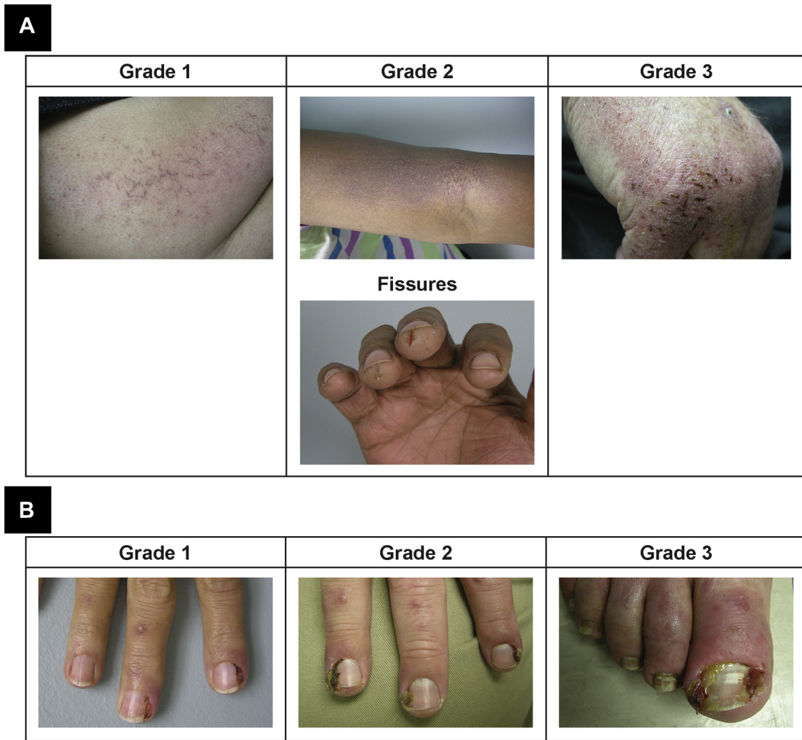
Figure 3 Photographs of (A) Xerosis and (B) Paronychia Occurring During Anti-Epidermal Growth Factor Receptor (EGFR) Therapy by Grade. The First Symptoms for Xerosis (ie, Rough, Dry Skin) Typically Occur Within 1 to 2 Months of Initiation of anti-EGFR Therapy. Paronychia (ie, Inflammation of the Nail Folds of the Fingernails and Toenails) Can Lead to Infection and Swelling/Tenderness and Usually Develops After Skin Reactions, Within 20 Days to 6 Months After Treatment Initiation

Patients are cautioned to avoid sunbathing, direct sunlight, hot temperatures, and humidity. 48,58,59,61 Patients should avoid manipulation of skin or hot blow-drying of the hair because these can increase the risk of infection. 39 Although the use of greasy creams such as petroleum jelly is highly effective, the treatment can cause folliculitis owing to its occlusive properties.