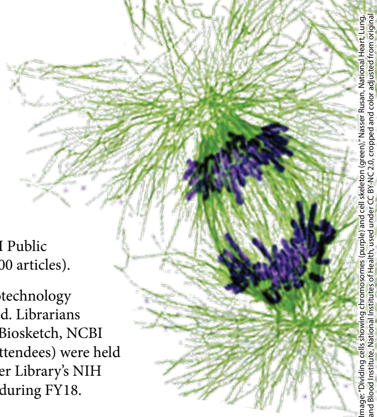
Image: "Dividing cells showing chromosomes (purple) and cell skeleton (green)," Nasser Rusan, National Heart, Lung, and Blood Institute, National Institutes of Health, used under CC BY-NC 2.0, cropped and color adjusted from original

Assistance with other NIH and National Center for Biotechnology Information (NCBI) author tools is also in high demand. Librarians have again focused on education and support for NIH Biosketch, NCBI My Bibliography and SciENcv. Five presentations (72 attendees) were held on NIH Public Access Policy and NIH Biosketch. Becker Library's NIH Biosketch online resource guide received 10,499 views during FY18.