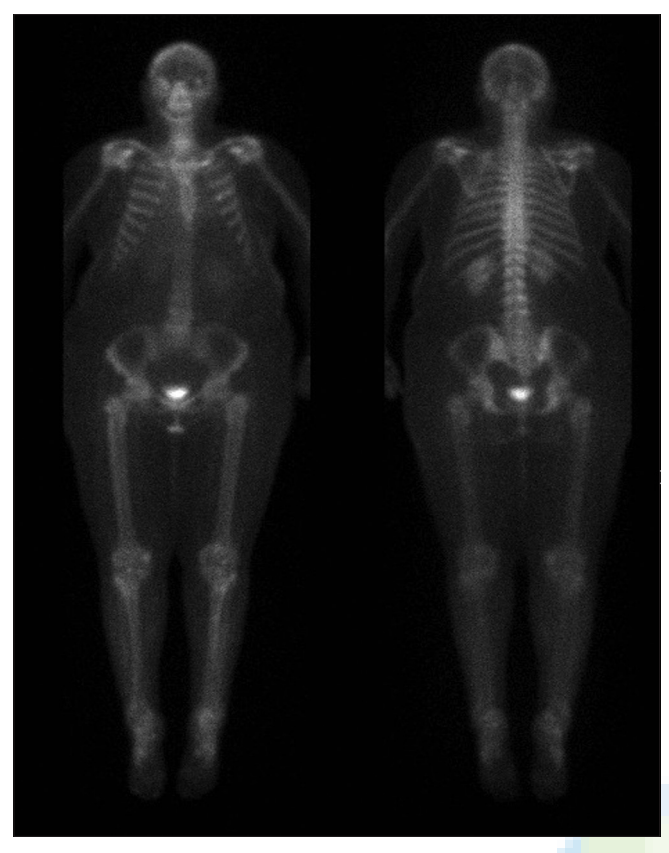
Figure 2: Technetium-99m methylene diphosphonate bone scintigraphy showing asymmetric activity in the right orbit and mild small focal activity in the left distal fourth rib on an anterior view (left image). No grossly abnormal activity was seen on the posterior view (right image)

Bonnet and Palko: False-positive bone scan in breast cancer patient