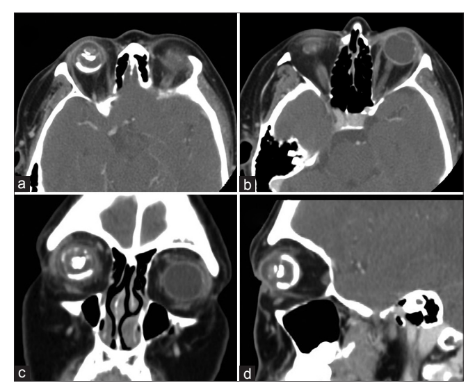
Figure 3: A contrast-enhanced computed tomography of the orbits demonstrated diffuse irregular nodular calcifications along the margins of the right globe and within the lens (a, c, and d). Right globe volume was also noted to be slightly less relative to the left. The left globe demonstrated faint foci of calcification along the lateral globe margin (b)

A contrast-enhanced CT scan of the orbits was obtained to localize and characterize this indeterminate activity. Irregular calcifications were noted along the posterior right globe, within the posterior natural lens and the posterior chamber of the eye [Figure 3]. The right globe volume was also decreased. The left globe demonstrated a senile calcific scleral plaque at the insertion of the lateral rectus muscle [Figure 3b]. Previous imaging of the orbits performed at an outside hospital several years prior established the temporal stability of the right intraocular calcifications. The patient's history confirmed a chronic lack of vision in the right eye, in addition to being