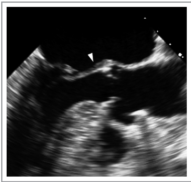
Figure 2. Representative residual MR group patient. The AML was tethered and its base thickened (arrowhead), resulting in reduced leaflet mobility (Video S4). AML indicates anterior mitral leaflet; MR, mitral regurgitation.