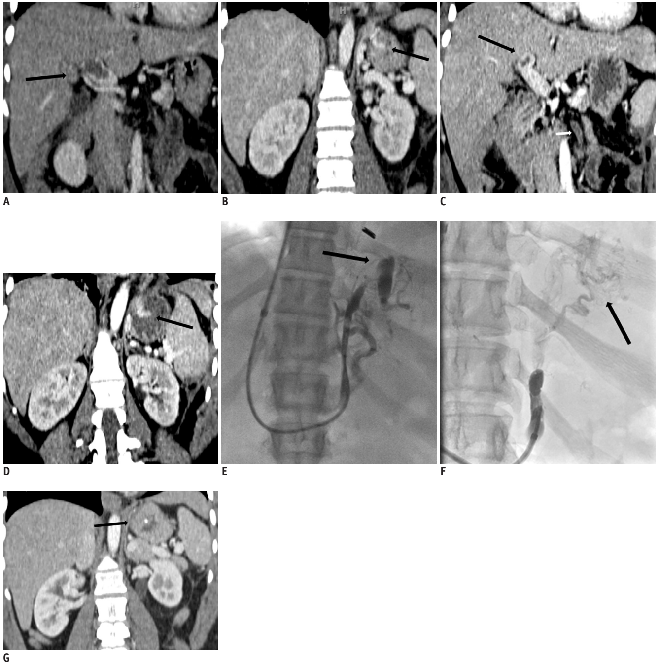
Fig. 1. 35-year-old woman with history of Crohn's disease, status post total abdominal colectomy, and portal vein and mesenteric vein thrombosis.

Due to the portal and inferior mesenteric vein thrombosis, she was planned to continue on anticoagulation with