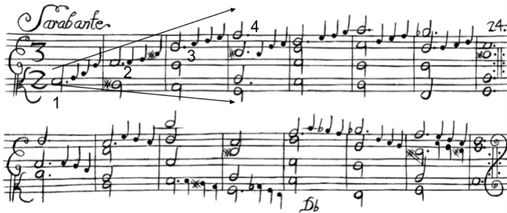
Ex. 2: Johann Paul Westhoff: Solo Suite No. 5, III. Sarabande 23

In the first four bars alone, this counterpoint is unmistakable. It begins as a simple unison 'a', to which a new voice is added to the texture in each consecutive bar. The line expands in contrary, stepwise motion to the dominant A major chord in bar four. Westhoff's genius lies in his ability to create so much expression out of so simple a