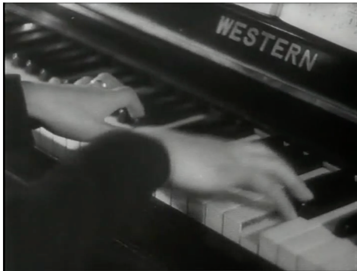
21 - Mitsuko's training. A "Western" brand piano didactically reminds the audience of the relationship between the East and the West.

not only as mediator between nature and modernity, but also as the mediator between East and West, which is subjected to depiction through the fascist aesthetic. Significantly, it is her silhouette which is contrasted against the mountainside, her body in the foreground against a background of lined-up women, and her emotions which are the object to be gazed upon, especially by the ambassador for the German audience, Gerda.