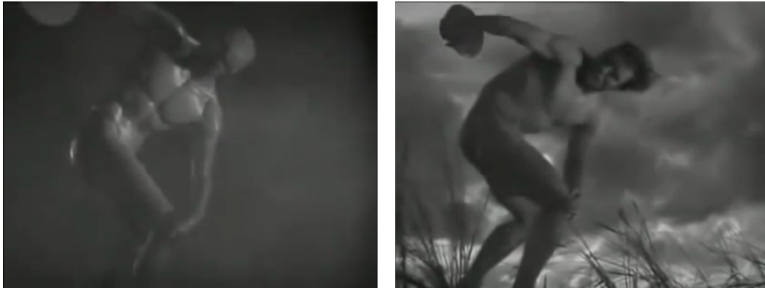
24 - Images transition from statues to living people.

the documentation of the games, as the torch is carried from the ancient people to 1936 Berlin.