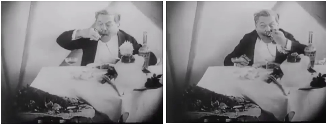
7 - A glutton shovels food into his mouth, a fork in each hand.

séance scene is just one way in which Lang participates in the binary depiction of the sexes, which ultimately privileges men over women.