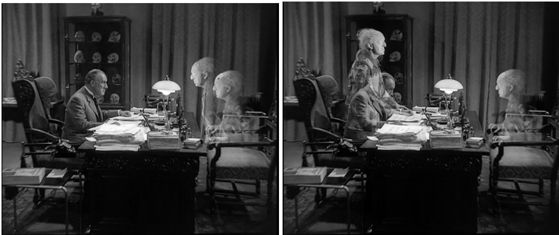
16 - Mabuse's ghost is rendered as a double superimposed image, making the depiction of a possession possible.

These supernatural powers are a motif shared by Der Spieler and Testament , but in the context of a Germany that has seen the rise to power of the Nazi party, these