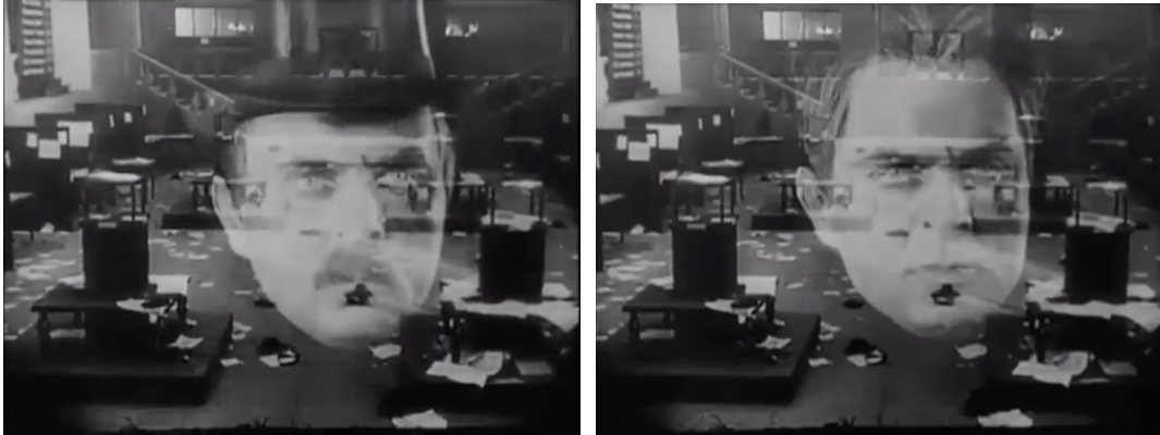
4 - Mabuse's disguise (left) fades away (right) as his superimposed face looms over the stock market.

form of the fascist aesthetic, by which a single figure is the sole point to which the eye is drawn: he stands above the rest of the men, calling out occasionally that he is buying and selling, and after the exchange closes, his face is superimposed over the room, the floor of which is littered with papers from the day's activity.