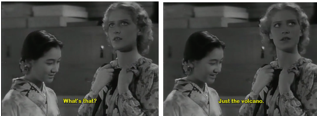
20 - Gerda, the European woman, is frightened by the volcano. Mitsuko, the Japanese woman, is unfazed.

Mitsuko struggles to accept Teruo's rejection. Mitsuko decides to commit suicide by jumping into a nearby volcano when Teruo continues to reject her. After speaking with his sensei, and after Gerda takes her (rather anticlimactic) leave of Japan, Teruo realizes the error of his ways; he has a duty to his people and his country to marry a Japanese woman, and he rescues Mitsuko at the last moment. Finally, they marry, have a child, and take up farming in Manchuria.