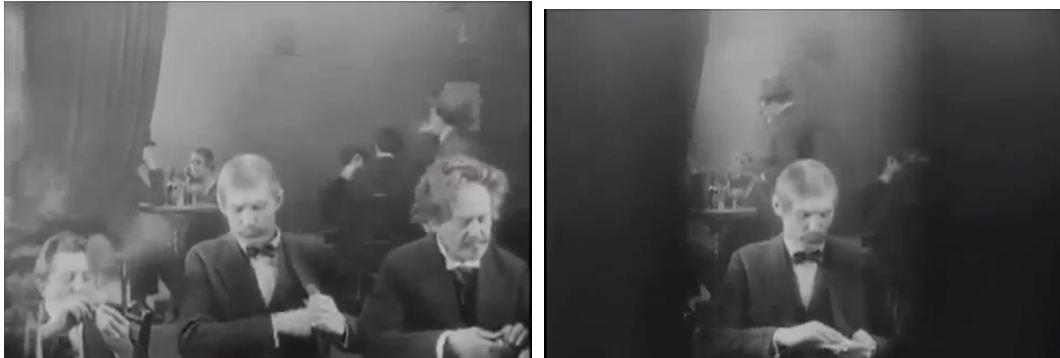
9 - Darkness encroaches from the left and right, shrinking the field of vision so that only Mabuse's victim is visible.

a glimpse into this lapse in mental wellness of the character, implying that Mabuse's supernatural powers are so effective that they can cross the boundary into the reality of the viewer, a boundary already crossed by the thrill-seeking viewer.