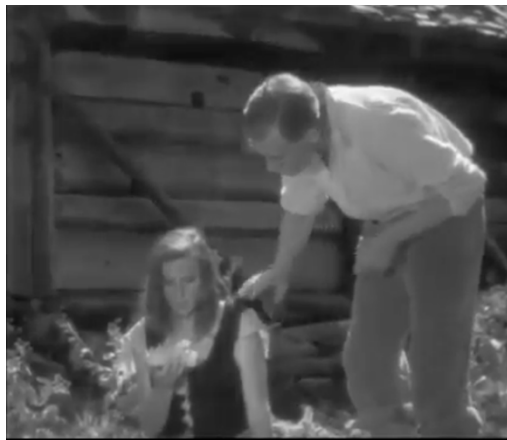
15 - Vigo cautiously approaches Junta, who seems to be hypnotized by the magical crystal.

people and uneducated people. Junta is educated in mountain climbing, whereas the villagers are not, but rather, turn to an archaic belief in magic to explain their failings as climbers, resorting to mob violence when yet another villager dies during the moonlit climb. Notably, Junta's ability to climb the mountain is treated as something strange or foreign (a theme one might remember from Weißer Hölle – here, too, a woman conquers the mountain), as one villager complains: “Senior... Warum kann die Junta aussteigen, die steile Wand, zum blauen Licht... wenn die Burschen oben stürzen... Die Junta... diese verfluchte Teufelshex'...” (“How can she climb towards the blue light on the steep side of the mountain, while the young boys fall down every time? This Junta, she's the damned devil's witch.”) Junta herself, however, is not immune to the magic of the crystals. When admiring them herself, she seems locked in a kind of trance until she is interrupted by Vigo.