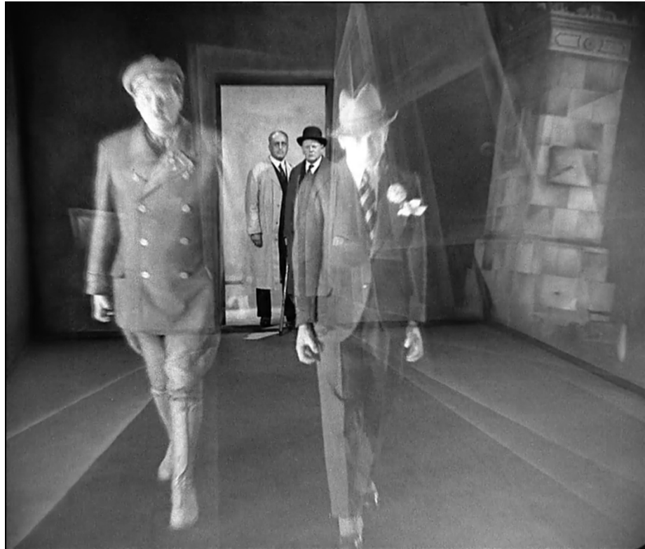
19 - Expressionist settings make a comeback in Testament and are combined with superimposition to enhance the shared experience of the audience with the patient.

Lang's repeated use of the same themes and aesthetics present in his previous films can also be seen in the depiction of men and women in Testament . The cast of Testament is largely male, with just one significant female protagonist, Lilli. Her role is further diminished in importance by the plot, in which the major events of the film are negotiated and completed by the men. Perhaps her most important contributions to the plot are during the flashback, in which she gives Kent money when there are no jobs at the employment office, and during the bomb scene, when she and Kent try every possible method of escape, eventually deciding on flooding the room. Lilli exists solely for the sake of a romantic plotline within the major plot line; she represents an ideal woman in that she longingly waits for Kent, has no qualms about