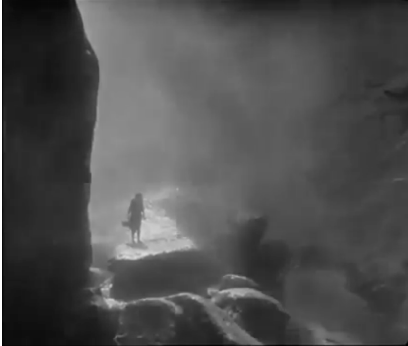
13 - Junta descends from the mountain early in the film, during the arrival of Vigo. She is dwarfed by cliffs and boulders (compare to Figures 2 and 3).

(monumentalization and the glorification of a single character return here), and she would eventually perfect the usage of these visuals, such that she is known for these things above all else.