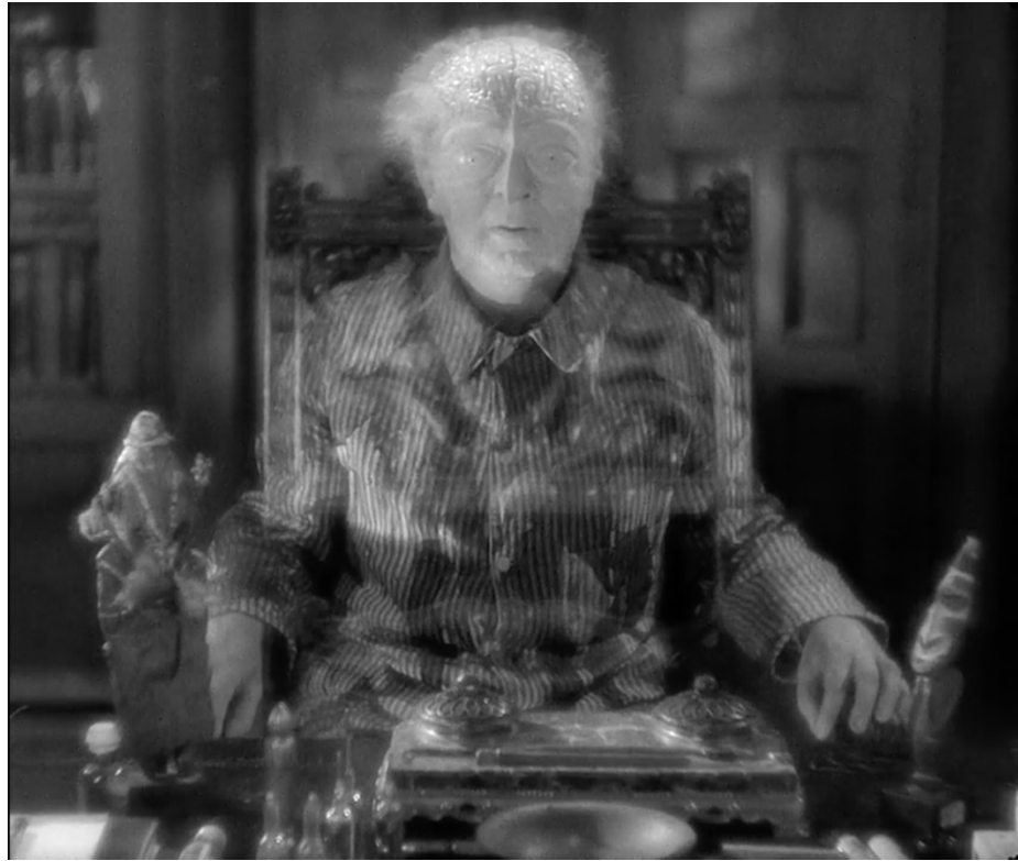
17 - Mabuse's ghost gazes not only at Baum, but also at the audience (compare to Figures 8 and 12).

bamboozling police and scientists alike. A new addition to his powers, however, is his ability to haunt his victims even after his death, when he possesses Baum.