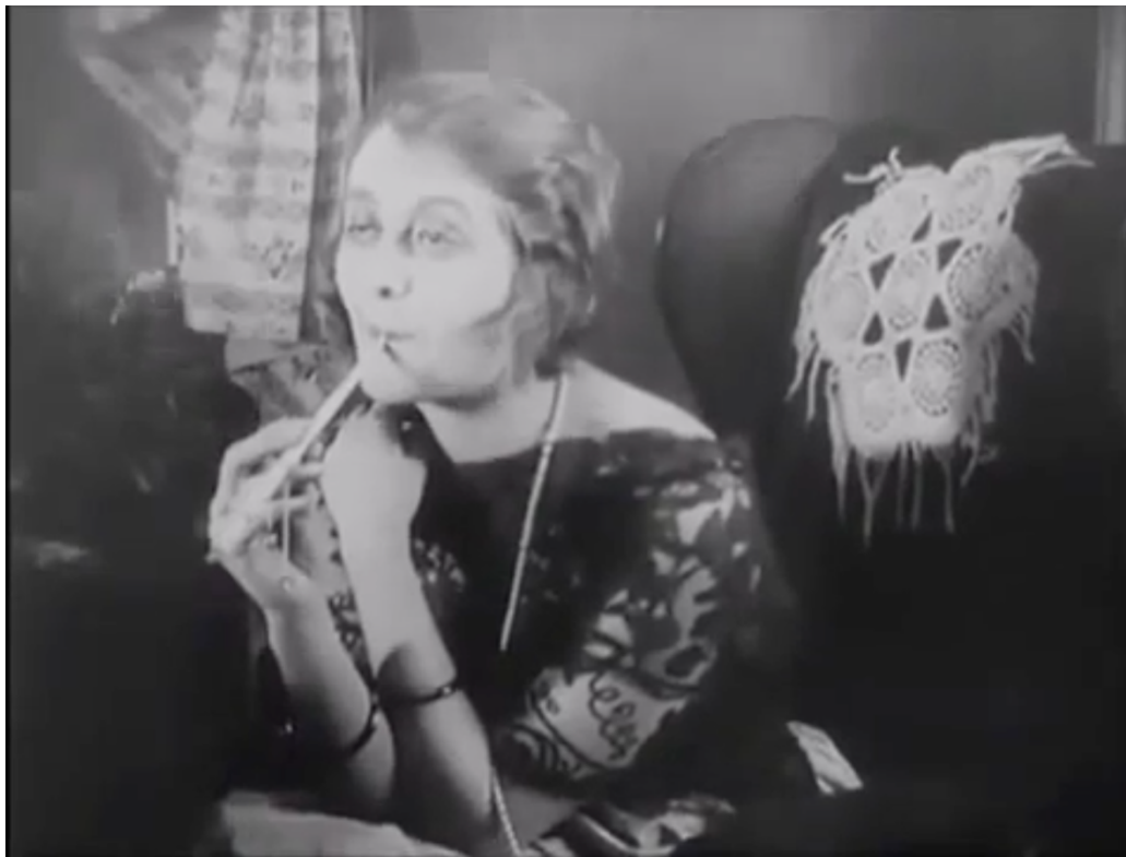
6 - The Countess smokes a long pipe while explaining to Mabuse that she finds the modern world boring.

Everyone at the table has both hands on its surface, with their eyes cast down, while the medium has hers cast upwards, with only the whites of her eyes visible. She announces there is a spirit present, and someone at the table turns the lights on. The Countess excuses herself from the ceremony, identifying herself as that strange presence, and explains to Mabuse, while smoking a long pipe, that she finds everything related to the modern world boring; he responds by explaining his preference to meddle in everyday lives and destinies.