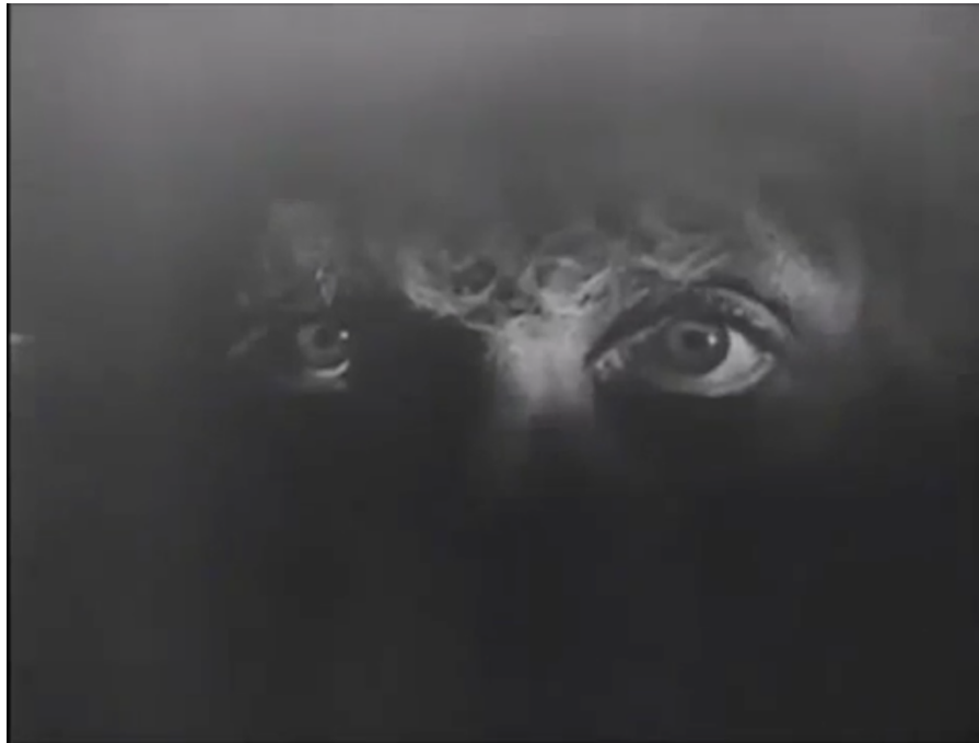
8 - Darkness from the top and bottom shrink the field of vision so that only Mabuse's staring eyes are visible (compare with figures 12 and 17).

card player is enchanted by the phrase “Tsi Nan Fu”: the words are superimposed to appear on and beneath the cards, disappearing temporarily when the player attempts to cover them up with the cards in his hand and forcing the player to lose his concentration, and eventually, the game. At the end of the second part, superimposed figures surround and haunt Mabuse, signaling hysteria from the overwhelming guilt of his crimes, such as his exploitation of blind people for his counterfeiting business. In other scenes, the line of sight for the audience is restricted as the film is edited to shrink the viewer’s scope, another example of the emphasis on a single figure, central to the fascist aesthetic.