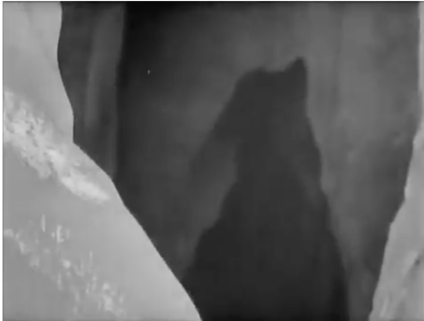
10 - In Weiße Hölle, crevasses are extremely abstracted, such that they appear vaginal (compare with figure 14).

of the journey. Ironically, before the climb begins, Dr. Krafft warns her not to climb, because “Das ist nix für ein Mädchen.” (“This is not for a girl”).