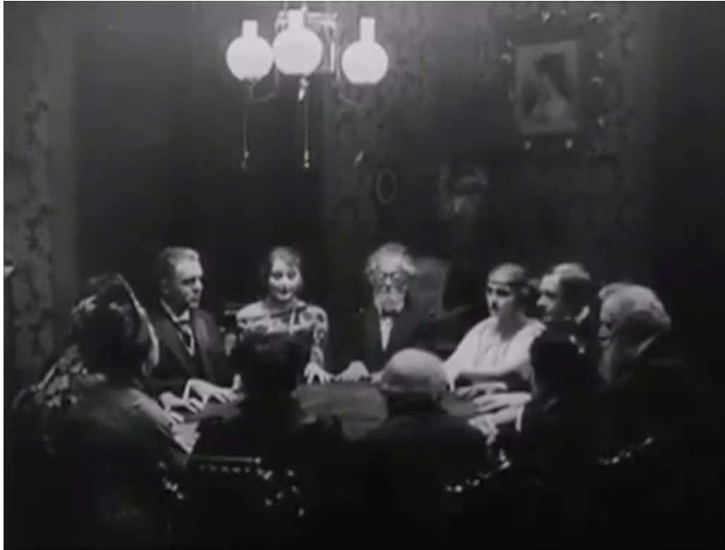
5 - The séance.

through Mabuse's disguise, temporarily. Throughout the film, gazes are related to the supernatural through the theme of hypnosis. Modern people, especially men, as represented by Mabuse's victims, cannot fight against the supernatural in any way; they succumb to those powers swiftly. The supernatural powers are depicted as more potent than modernity and its new technology, providing a criticism about the rapid advancements of Weimar society. The film does not necessitate a return to traditional values, either, but the potency of the supernatural suggests that, despite humanity's efforts to make progress, there will always be some irresistible obstacle which hinders progress.