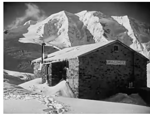
Figure 1 - Establishing shots from Mabuse (left) and Weißer Hölle (right) make the urban and mountain locations of the narratives clear.