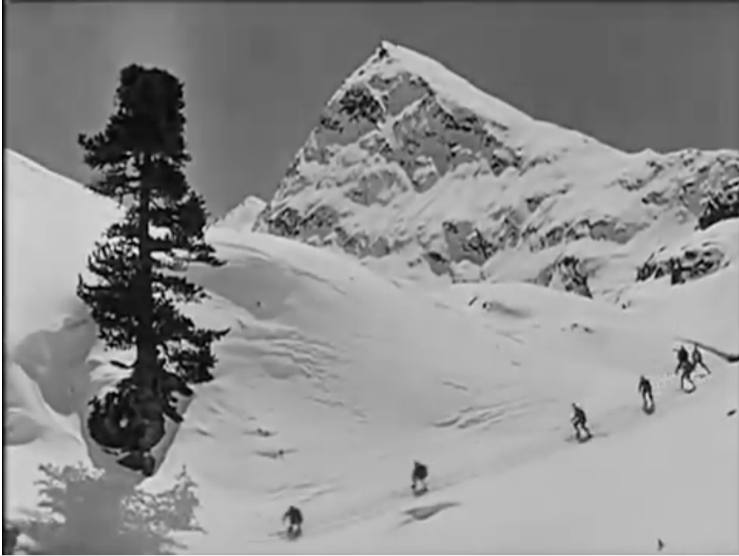
3 – Another example of the idyllic settings in Weiße Hölle , in which the juxtaposition of small humans against the enormous mountains creates a sense of awe and fantasy.

Kracauer, Eisner, and Elsaesser provide critical readings that explain the relationship between what is seen in Mabuse and what actually existed or could be observed in Weimar society: Mabuse is indeed one of those films in which contemporary “lusts” are put on display and critiqued, not only through a realistic and recognizable depiction of contemporary issues, but also through fantasy, metaphor, and mimicry, which underscore and make visible the film’s critical representation of the Weimar Republic. Mabuse , therefore, is neither a mere depiction of the times nor pure fantasy; it combines both to create a social critique of modernity, which enables particular kinds of mental and physical illness and an undesirable form of femininity,