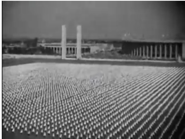
25 - Women exercise in a field en masse.

elongated series of montages that puts the beauty of the athletic body on display. In this half of the film, more footage from the games is shown (particularly the more modern ones, such as boxing, sailing, and fencing) alongside clips of athletes training, stretching, and dancing. In one scene, a woman stretches, moving her body fluidly, as if she were dancing. Accompanying this is an extradiegetic track of a single flute playing. A cut reveals more women nearby the first one, and more flutes join in the music. An escalating series of cuts reveals an ever greater number of women in the frame, until the camera pans across an enormous field of women all doing this same exercise routine, in a scene rather reminiscent of the quintessential Riefenstahl shot from Triumph des Willens ; instead of rows of soldiers standing at Hitler's attention, there is a mass of exercising women.