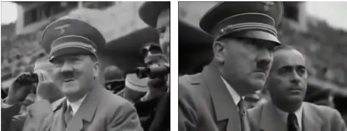
26 - Hitler enthusiastically watches the Olympic games, expressing joy when athletes perform well (left) and concern when they do not (right).

Gerda's role in the film is particularly important for the German audience, who can easily identify with her and her attempts to understand Japanese culture which, by the end of the film, still remain strange to her: she still cannot get used to the frequent earthquakes caused by the volcano, she cannot eat with chopsticks, and she cannot refrain from commenting on any and all similarities and differences between Japan and Germany. In Olympia , it is necessary for Riefenstahl to depict multiple nationalities, as that is the nature of the Olympic games, but she does not neglect her duties as propagandist. Her depiction of Hitler is rather flattering: he opens the games with a short announcement, and the people respond with cheers and salutes. He is also seen watching the games, responding similarly to other people in the audience. He smiles and cheers when athletes perform well and commiserates when they do not. He, therefore, is depicted as friendly or approachable; despite being venerated, he is just as relatable as the ordinary citizens who are watching the historical games.