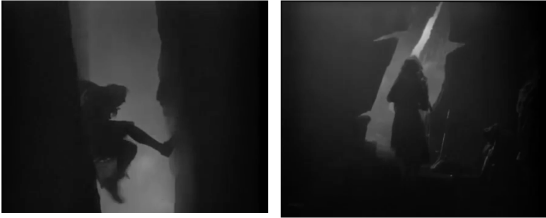
14 - Vaginal mountain formations, like the ones in Weißer Hölle , are recreated in Das blaue Licht (compare to figure 10).

reverence they inspired, while The Blue Light was designed to shift attention to the foreground, onto the character [Riefenstahl] had invented for herself” (Bach 70).