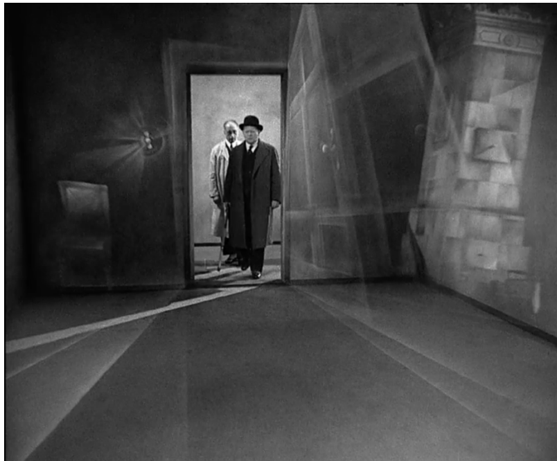
18 - Expressionist settings make a comeback in Testament and are combined with superimposition to enhance the shared experience of the audience with the patient.

a complex portrait of the relationship between the supernatural and tangible realms. What does Lang express when telekinesis is exercised by a traumatized man? On the one hand, it appears as though the typical hierarchy seen in previous films, in which a particular image of mental and physical wellness is given preference above mental and physical illness, has been flipped; even in death, Mabuse has the upper-hand. On the other hand, Lang constructs, in this film and in the films Kaes lists, a complicated yet sympathetic image of mental illness: the audience is supposed to feel a mixture of disgust and pity towards Mabuse, much like they do towards Hans Beckert, the serial child-murderer in M . This continuity is compounded by the use of a set design remarkably similar to that used in Das Cabinet des Dr. Caligari , visible to the audience only when the camera is facing from the same position as Hofmeister, himself. Hofmeister, however, cannot be read in this same way as Mabuse; he is undoubtedly a sympathetic character.