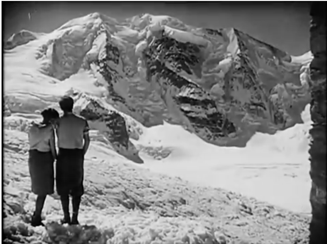
2 - Examples of the idyllic settings in Weißer Hölle , in which the juxtaposition of small humans against the enormous mountains creates a sense of awe and fantasy, contributing to the theme of monumentalization.