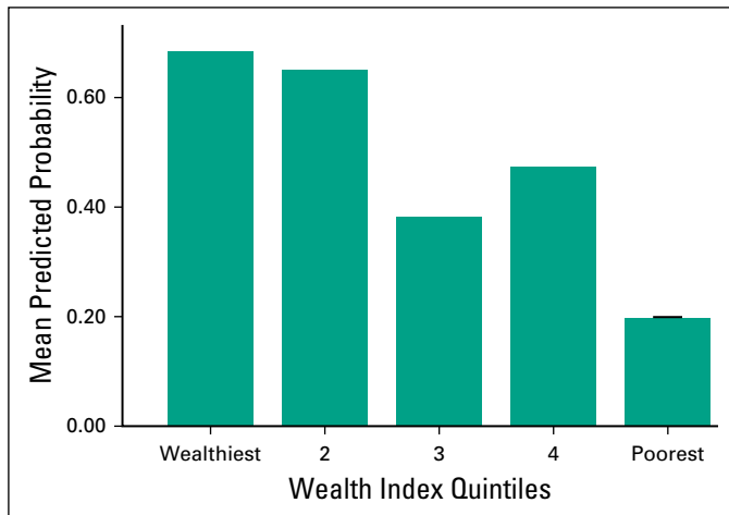
Fig 1. Logistic regression model of traditional/complementary alternative medicine by wealth quintiles (Argentina).

traditional remedies. A thorough understanding of the factors that contribute to variations in TCAM use will be important as policy, research, clinical, and educational guidelines evolve.