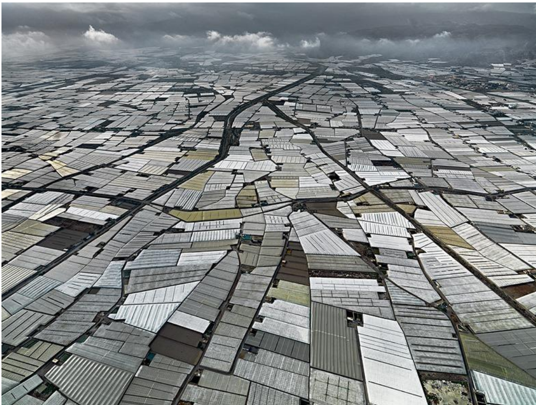
Figure 1 Endless fields of greenhouses in Almeria

(Kaushik). At first glance, this appears to be the perfect set-up for the province, but in reality, the greenhouses offer dangerous working conditions for employees. Temperatures often go as high as 45 degrees Celsius, (approximately 113 degrees Fahrenheit), workers are underpaid for their work, and the farms lack basic amenities such as toilets (Kaushik). If diversification of the economy is considered to be unrealistic, the current investments can at least ensure that the conditions and jobs are sustainable.