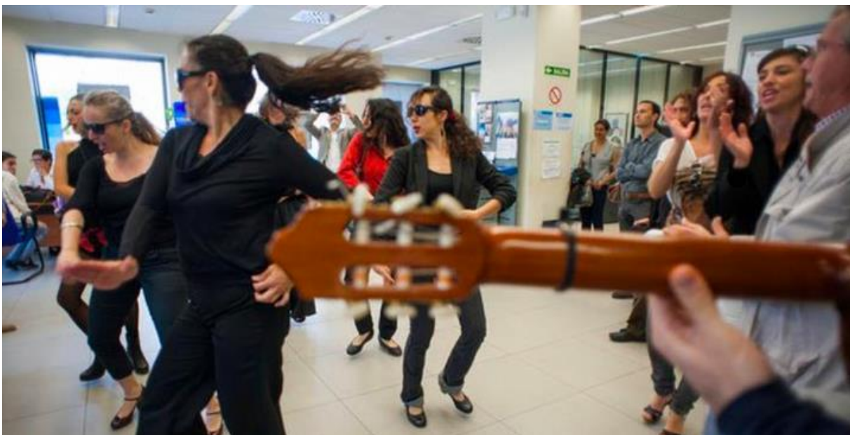
Figure 2 Flash-mob group Flo6x8 protesting at a local Spanish bank

movement was born, with “massive protests...staged in Madrid’s central Puerta del Sol square” (El Pais). Their message was clear: “the political class was hemorrhaging its credibility” (Hedgecoe). That year alone, around 21,000 protests took place all over the country. Considered to be what inspired the Occupy Wall Street protests in New York, Spaniards from all over the country spoke out against high unemployment rates, the political system in Spain and the Spanish politicians involved in the financial disaster. Although “the movement [refused] to set any political agendas... [it took] a grassroots approach to activism by offering practical solutions to the problems [of unemployment]” (Elola). Another form of protest that Spaniards utilized to get their message across is flamenco. Known as “Spain’s most alluring cultural phenomenon... [it has now become] a powerful tool for voicing political protest” (Machin-Autenrieth). The most well-known group is Flo6x8, and after being inspired by 15M they have gone to banks and protested. Seen as a statement against the banks that funded and helped create the housing bubble, they have even gone to the Andalusian Parliament, speaking out against the region’s continuous high rates of unemployment and corruption.