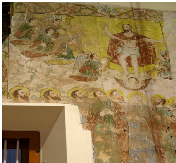
Fig. 2 Jesus Ascent to Heaven (right). St. Mary Jacobite Syrian Church Angamaly Kerala.