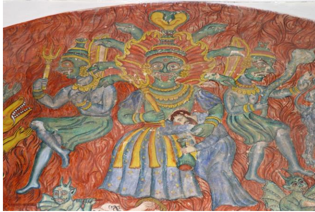
Fig. 14 Bhagavathi (Bhadrakali) as Satan. Detail of the “Vision of Hell.” St. Mary Jacobite Syrian Church, Angamaly, Kerala.