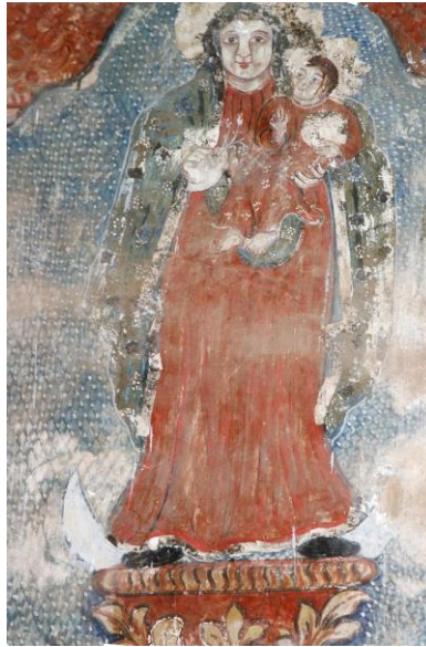
Fig. 10 Immaculate Conception with Infant Jesus at the centre of the painted retablo . St. Mary Jacobite Syrian Church Angamaly Kerala.