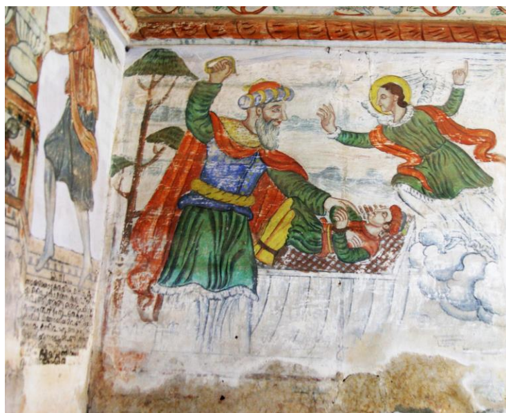
Fig. 4 Abraham and Isaac. St. Mary Jacobite Syrian Church Angamaly Kerala.