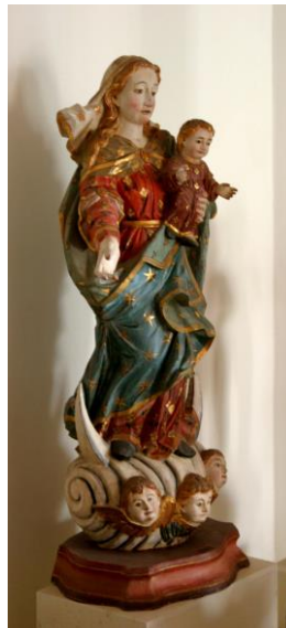
Fig. 11 Mary as Immaculate conception with Child. Indo-portuguese art. Museum of Christian Art, Cochin, Kerala, India XVII c.