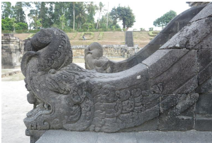
Fig. 6 Makara. Candi Sambisari, Java, Indonesia.