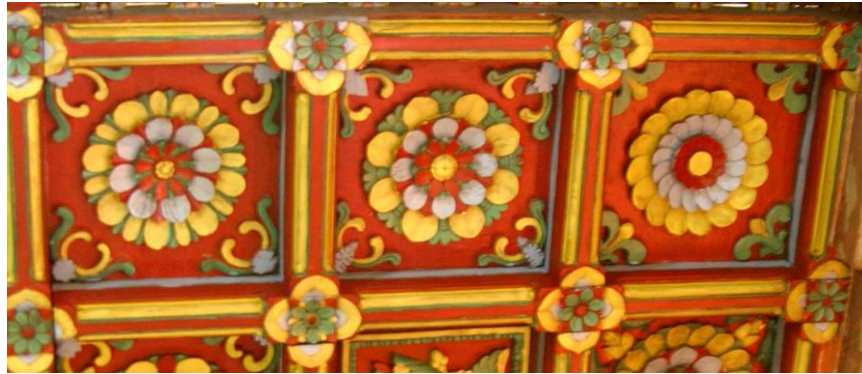
Fig. 7 Coffered ceiling. St. Mary Jacobite Syrian Church Angamaly Kerala.