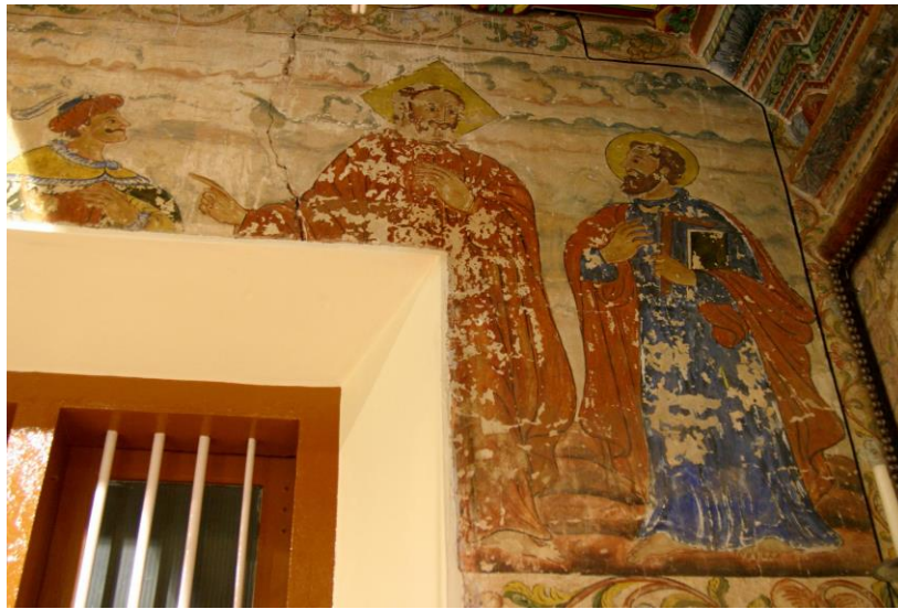
Fig. 1 Christ (centre) St Thomas (right) and an Indian belonging to a High caste (far left). St. Mary Jacobite Syrian Church Angamaly Kerala.

record for being the largest single gathering of women for a religious activity. Only women are allowed to participate in the Pongal ritual. Devotees from across the country and even from abroad participate in the ritual. 17 So Christianity reached Kerala, but Bhagavathy the Great Goddess did not leave.