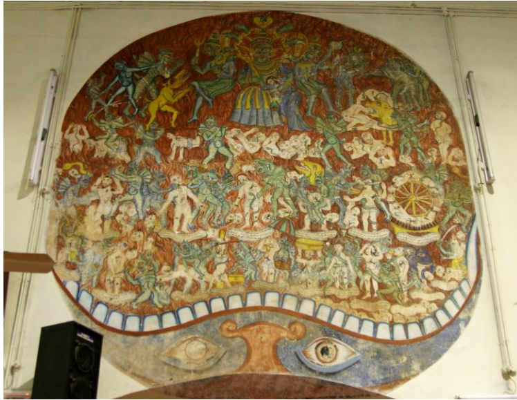
Fig. 12 Vision of Hell. St. Mary Jacobite Syrian Church Angamaly Kerala.