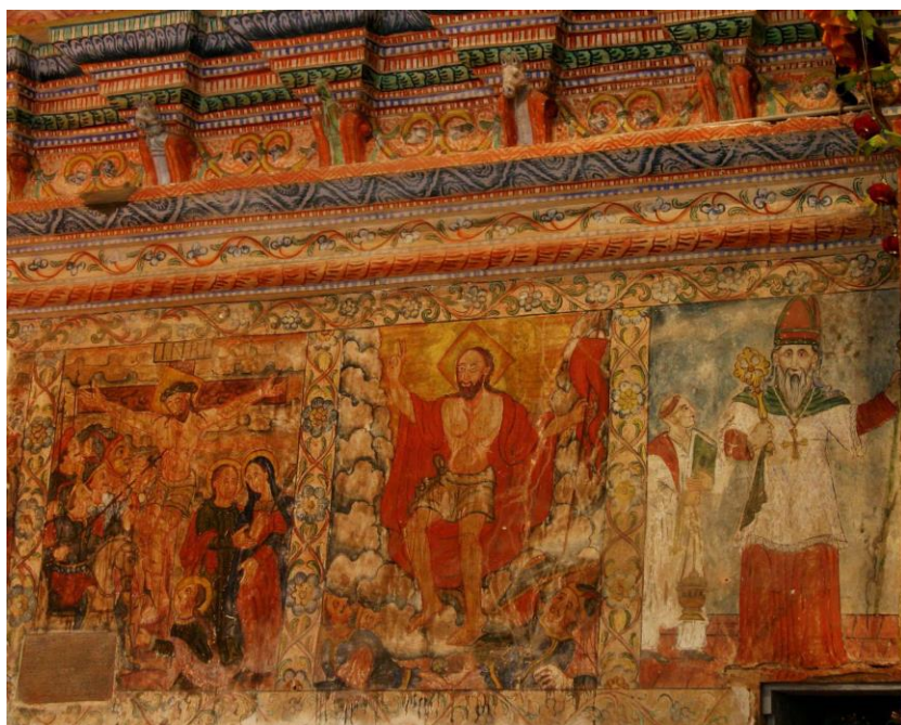
Fig. 3 Crucifixion, Resurrection and St. Mar Thoma (1653-1670) ? St. Mary Jacobite Syrian Church Angamaly Kerala.