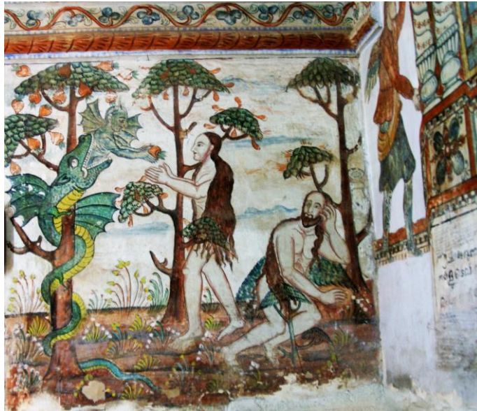
Fig. 5 Adam and Eve in the Garden of Eden. St. Mary Jacobite Syrian Church Angamaly Kerala.