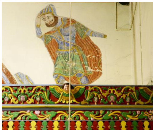
Fig. 9 Goliath. St. Mary Jacobite Syrian Church Angamaly Kerala.