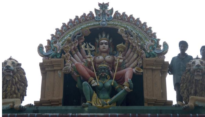
Fig. 13 Bhagavathi (Bhadrakali), Mandaikadu temple, Kerala.