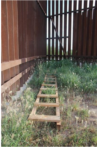
FIGURE 4: LADDER ON THE BORDER WALL IN THE RIO GRANDE VALLEY CIRCA 2016. 66

Ladders are one means to go over the border wall. There are other options. Some may simply climb over in opportunistic places. One may go under the wall via tunnels. Another may buy a plane ticket and over stay a visa. The possibilities to migrate to the U.S.A are endless. Where there's a wall, there's still a way to get past.