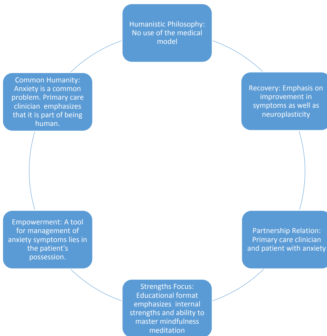
Figure 2. Recovery Alliance Therapy Constructs and Project Design

The RAT was based on a concept of a recovery-based approach to the treatment of mental disorders using a working alliance between the nurse and patient. A search for evidence-based alternative or adjunctive therapies that could be initiated in a busy primary care office favored mindfulness-based meditation as a logical choice due to low cost and no need for additional staff, such as would be the case with other treatments (i.e., acupuncture, massage, in-house behavioral health counseling, etc.). Figure 2 demonstrates how the project aligns with the constructs of the theoretical framework.