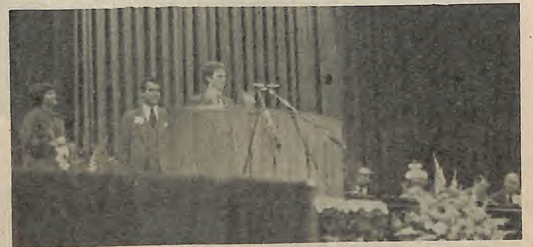
A GARDNER-WEBB COLLEGE hearing-impaired student tells the convention crowd of 3,000 "thank you for Gardner-Webb."