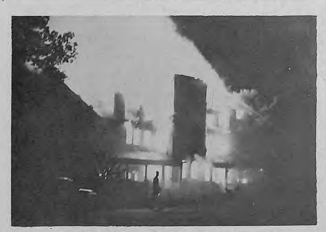
1957 - Huggins-Curtis Building burns - Possible electrical short.