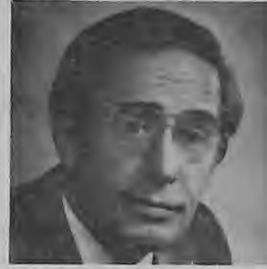
Richard M. Devos