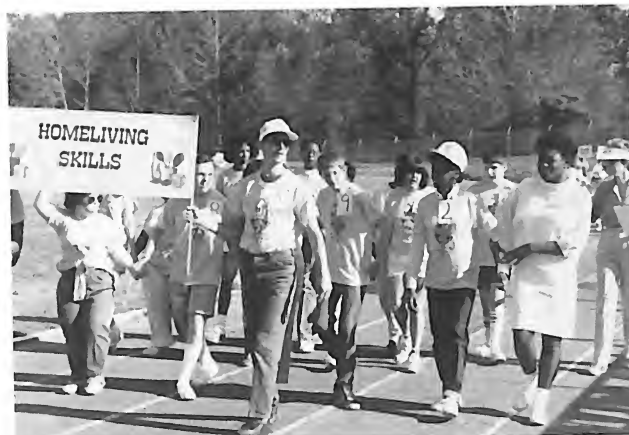
The opening parade featured the Special Olympians from Cleveland County.