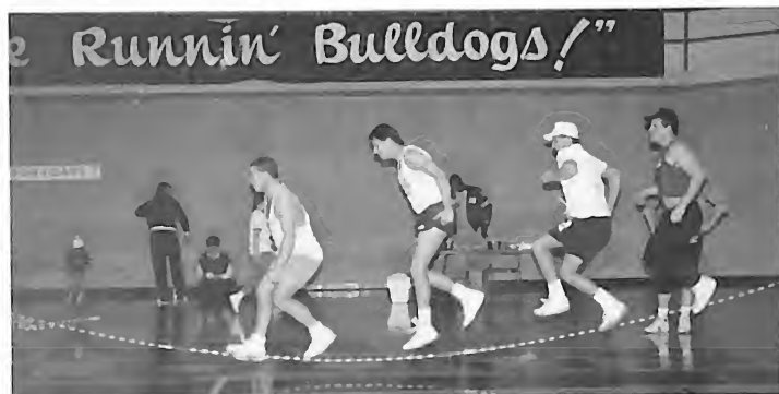
Jump Rope for Heart: Students jumped to raise $844.50 for the American Heart Association