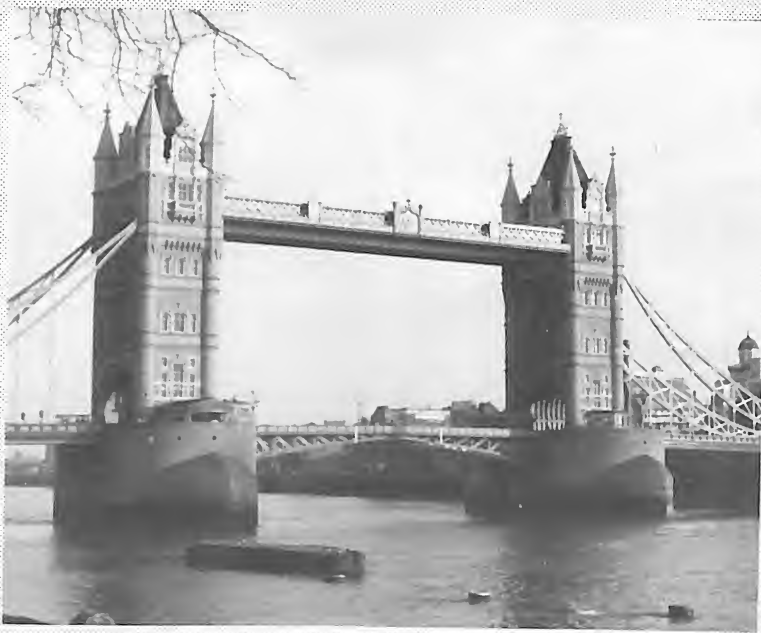
London's Tower Bridge, seen from the Thames River.

Stowe feels that part of the educational value of travel is exposure to such attitudinal differences.