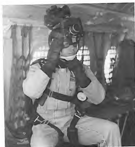
This jumper, his cameras strapped to his helmet, supplied the color picture on the front of The Web.