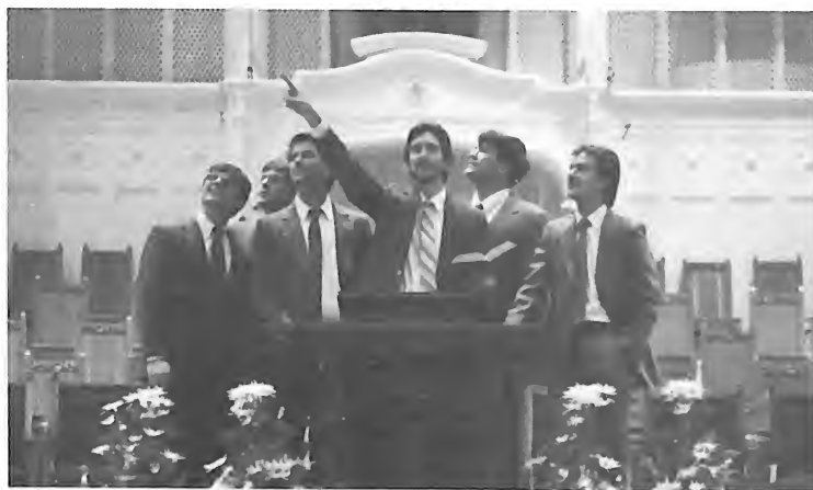
Future preachers test the pulpit at First Baptist Church, Dallas.

Certainly this flock returned with a better understanding of the larger flock called Southern Baptists.