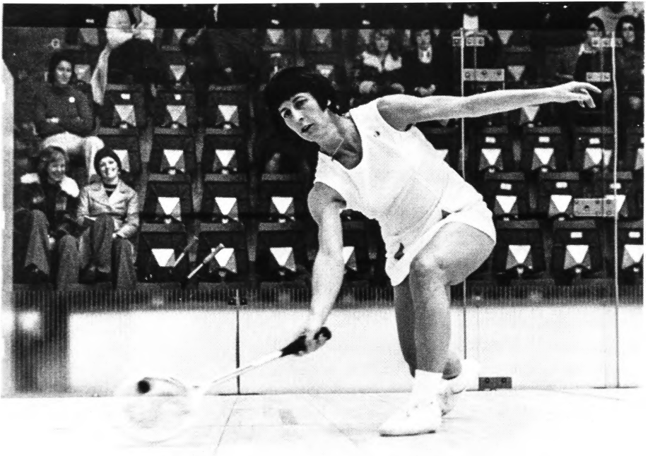
Heather McKay, 1976

prepared themselves well, that when they go out, they are going to play up to expectations. That's what I always felt — and made sure of — that when I went away to a tournament, I had prepared well. Then I knew I'd done all the work, and, if everything went right, I should win.