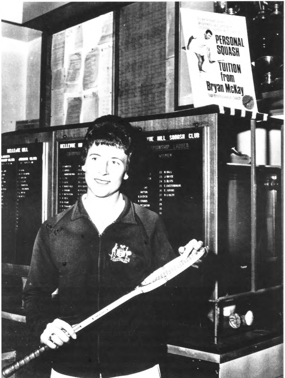
Heather McKay, squash champion