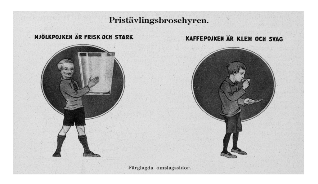
Fig 2. 'Pristavlingsbroschyren', Mjölkpropagandan. Sweden, 1926. http://blog.soziologie.de/2014/12/die-moderne-als-bildprogramm/