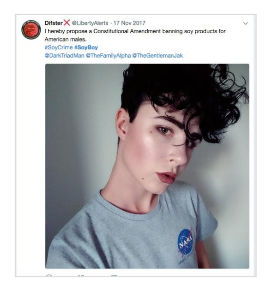
Fig. 5 'Constitutional Amendment'. Twitter.com, 17 November 2017. User account suspended.

As with the 'effeminate rice eater' trope from colonial times, the trope of the emasculated 'soy boy' is associated not only with cherry-picked science but also of racist stereotypes linking broadly 'Asian'-coded foods — rice and soy — to weakness and emasculation. That can be seen played out in a pair of #SoyBoy tweets (figs. 5 and 6). One, from November 17, 2017, depicts a pale, slender, dark-haired, man who some may consider vaguely 'Asian' in appearance wearing lipstick and eye makeup; the tweet says 'I hereby propose a Constitutional Amendment banning soy products for American males.' The other, dated October 5, 2017, depicts a pink-and-purple 'feminine' coded Japanese anime character with sparkling purple eyes; the character is holding a bottle of Soylent soy milk and the caption reads 'Started buying @soylent for my son, he's a bonafide #SoyBoy now!'