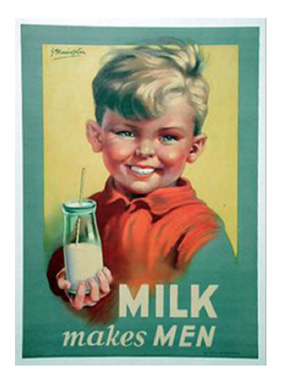
Fig 1. 'Milk Makes Men'. USA, 1930s; Josh Harkinson, 'The Scary New Science That Shows Milk Is Bad For You', MotherJones.com, Nov./Dec. 2015 issue, https://www.motherjones.com/environment/2015/11/dairy-industry-milk-federal-dietary-guidelines/