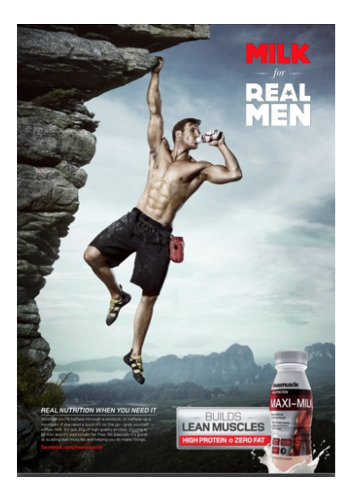
Fig. 3: 'Milk for Real Men'. Maxi-Milk, USA, 2012; SeanLerwill.com, 30 Aug. 2012, http://www.seanlerwill.com/maximuscle-maxi-milk/.

As the next section discusses, the alt-right also uses milk to construct tropes of 'milk masculinities', with dairy being used to exemplify whiteness and virility and plant milk — in particular soy milk — being used as a symbol of weakness and emasculation.