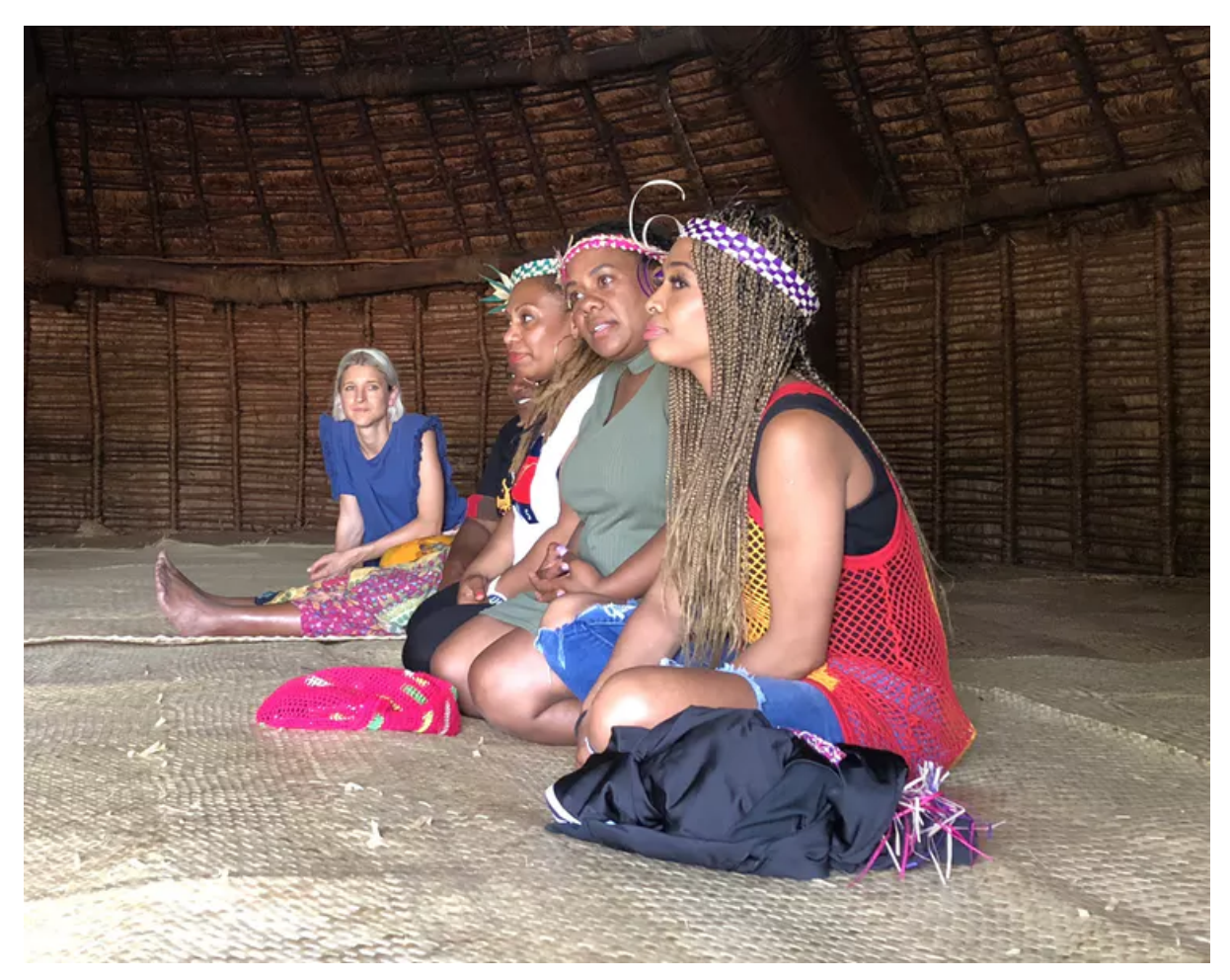
Black Sistaz singing for the Chief at Hapetra.

As Melanesian nations still under colonial rule, West Papuans and Kanaks consider their fate to be intertwined — each believes the other can assist in achieving sovereignty over their own soil. Kanak musicians have also composed songs advocating for an independent West Papua, such as Free West Papua by the acoustic kaneka band, Lyric Kanak Gong.