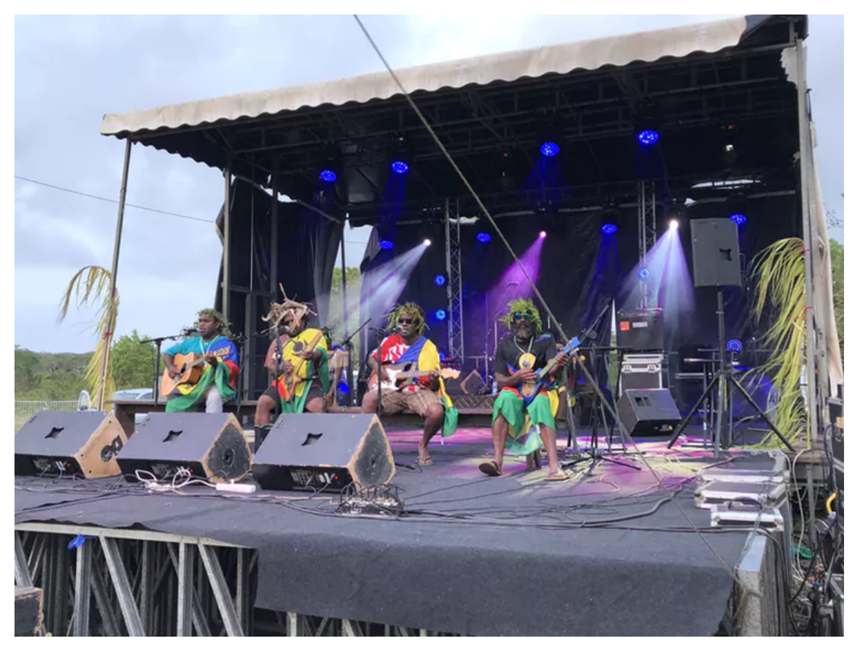
Members of Kool Groove at Fest Mela, draped in the Kanak flag.

Fest Mela was headlined by the Melbourne-based West Papuan group, Black Sistaz, who are daughters of the renowned West Papuan independence activist band of the 1980s, the Black Brothers.