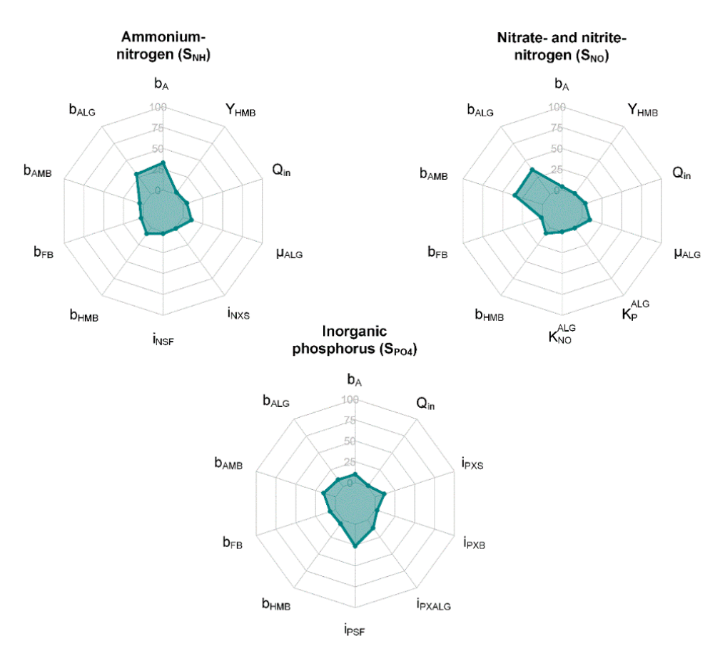
Figure 4. Ten most significant parameters influencing the variability of ammonium-nitrogen, nitrateand nitrite-nitrogen, and phosphate in the waste stabilization pond (WSP) systems. The results in the radar graphs are the proportion of sensitivity function (s_{ij}) for the state variable against the changes of each model parameter over the total sum of sensitivity measures. The description of the influential parameters in the graph can be found in the Supplementary Material F.

As shown in Figure 4, the variability of nutrient variables was affected significantly by the rate of growth and decay of algae. Particularly, around 40% of the total variance of S_{NH} within the pond systems was caused by the metabolisms of algae, suggesting the important role of both algal assimilation and oxygen supply to nitrification of autotrophs in ammonium removal. While the decay of bacteria is a minor source of S_{NH} in the system, which is reflected by a small contribution percentage of decay rates of other bacteria, these processes contributed around 25% of the variability of S_{NO} and S_{PO4} . These results suggest that as a result of long hydraulic retention time, bacteria and algae in the pond systems can release nutrients into the water body via their decay process. This reflects on the list of influential parameters for S_{PO4} containing high contribution percentage of phosphorus fraction in different components, which are related to the decay process of algae and different bacteria. In contrast to this contribution, the disappearance of parameters related to heterotrophic bacteria in nitrogen removal and the chemical precipitation process in phosphorus removal suggest their marginal role in pond systems.