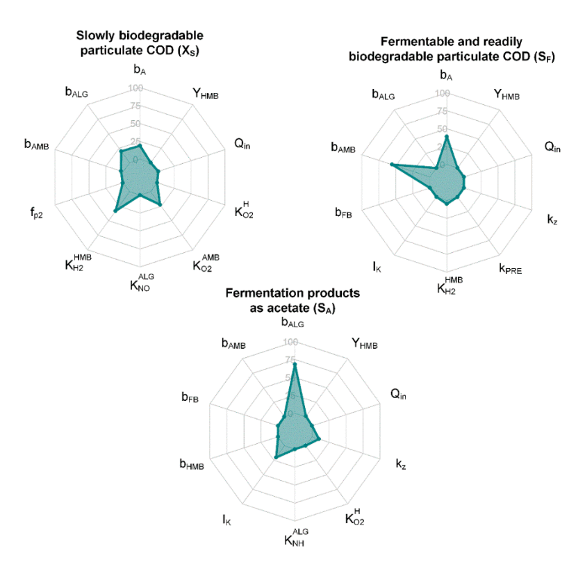
Figure 3. Ten most significant parameters influencing the variability of slowly biodegradable particulate COD, fermentable and readily biodegradable soluble COD, and fermentation products as acetate in

As can be seen from Figure 3, the following parameters were found to have a significant impact on the variability of X_S (listed in the decreasing order of importance): K_{H2}^{HMB} , K_{O2}^{AMB} , b_A , and b_{ALG} . The first two coefficients suggest the important role of methanogenic bacteria in anaerobic digestion, which is the main removal process of X_S . While the low concentration of H_2 as the electron donor in pond systems is the limiting factor of the growth of HMB, a very low value of K_{O2}^{AMB} , 0.0002 g O_2 .m<sup>-3</sup>, indicates the high sensitivity of this bacteria toward O_2 . The influence of the oxygen level in the system on OM removal is displayed in the presence of the decay rate of algae, the main oxygen producer, and autotrophs, the main oxygen consumer, whose changes also significantly affect the total variance of S_F and S_A . In fact, as algal photosynthesis is the only source of O_2 for heterotrophs to degrade S_A in the FPs and MPs, the decay rate of algae appears to be a main contributor to its total variability, together with other photosynthesis-related parameters, including the light extinction coefficient and light saturation constant. Also noteworthy is that AMB proves to have a more important role in removing S_F compared to HMB in anaerobic digestion as b_{AMB} contributes to 35% of the total variance of S_F , which can be explained by the fact that their electron donor, S_A , is more available than H_2 .