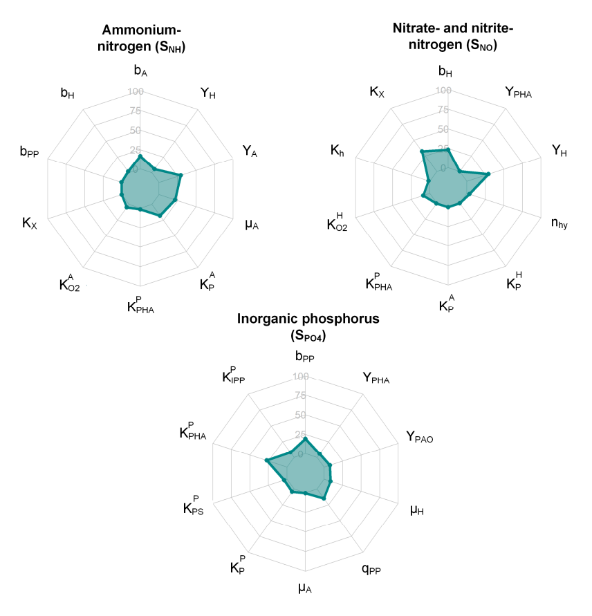
Figure 2. Ten most significant parameters influencing the variability of ammonium-nitrogen, nitrateand nitrite-nitrogen, and phosphate in the activated sludge (AS) systems. The results in the radar graphs are the proportion of sensitivity function ( s_{ij} ) for the state variable against the changes of each model parameter over the total sum of sensitivity measures. The description of the influential parameters in the graph can be found in the Supplementary Material F.

likewise with particulate phosphorus. As such, the most influential model parameters for nutrient removal represented by the variance of S_{NH} , S_{NO} , and S_{PO4} are shown in Figure 2. Regarding the first state variable, it appears that nitrification is a main process of ammonium removal in the AS system, which is indicated via the growth of ammonium and nitrite oxidizers as Y_A , \mu_A , and K_P^A and are responsible for up to 70% of the total variance. On the other hand, parameters related to denitrification, i.e., Y_H , K_P^A , and b_H , contributes around 50% of the total variance of S_{NO} , indicating the significant role of denitrification in nitrite and nitrate removals. Besides, hydrolysis also appears to be important to the variability of S_{NO} , which can be explained by the fact that, apart from the influence, hydrolysis is the main source of S_F , the only electron donor of the denitrification process in this case. As such, the changes in values of K_h , K_X , and n_{hy} can affect considerably the availability of S_{NO} in the AS systems. Note that the process of bacterial assimilation plays an insignificant role in both nitrogen and phosphorus removal. The latter process is mainly carried out via PAOs, the group of organisms that have the ability to accumulate phosphorus in excess of normal metabolic requirements [35]. As such, from the radar graph, most of the influential parameters for S_{PO4} are related to the metabolic process of PAO.