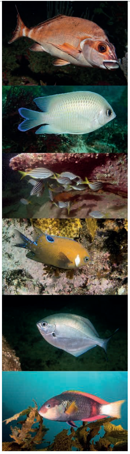
Figure 3: Five species (photos from top to second from the bottom are red morwong, immaculate damsel, mado, white-ear and silver sweep) that are common on shallow reefs and previously had an accepted depth range of <30 m were observed regularly on deeper reefs in this study (>50 m). Crimson-banded wrasse (bottom photo) was also observed outside their depth range on a small number of samples.

Once off the reef edge, the fish communities found on the surrounding sandy areas begin to change and are very different to those on the reef (Schultz et al. 2012). Our study area is no exception; the patch reefs at a depth of 50 m tend to be dominated by a range of more colourful or conspicuous species, whilst the surrounding sand habitats sampled in Fetterplace (2018) are dominated by flatheads (Platycephalidae), which use camouflage and burial in the sand to ambush prey. In contrast to the reef samples, none of the species encountered in comprehensive sampling on soft sediments at a depth of 50–60 m was outside its depth range (Table 1). Species that occur on sand are much more likely to have been caught in scientific or commercial trawling and the capture depths then included in the scientific records.