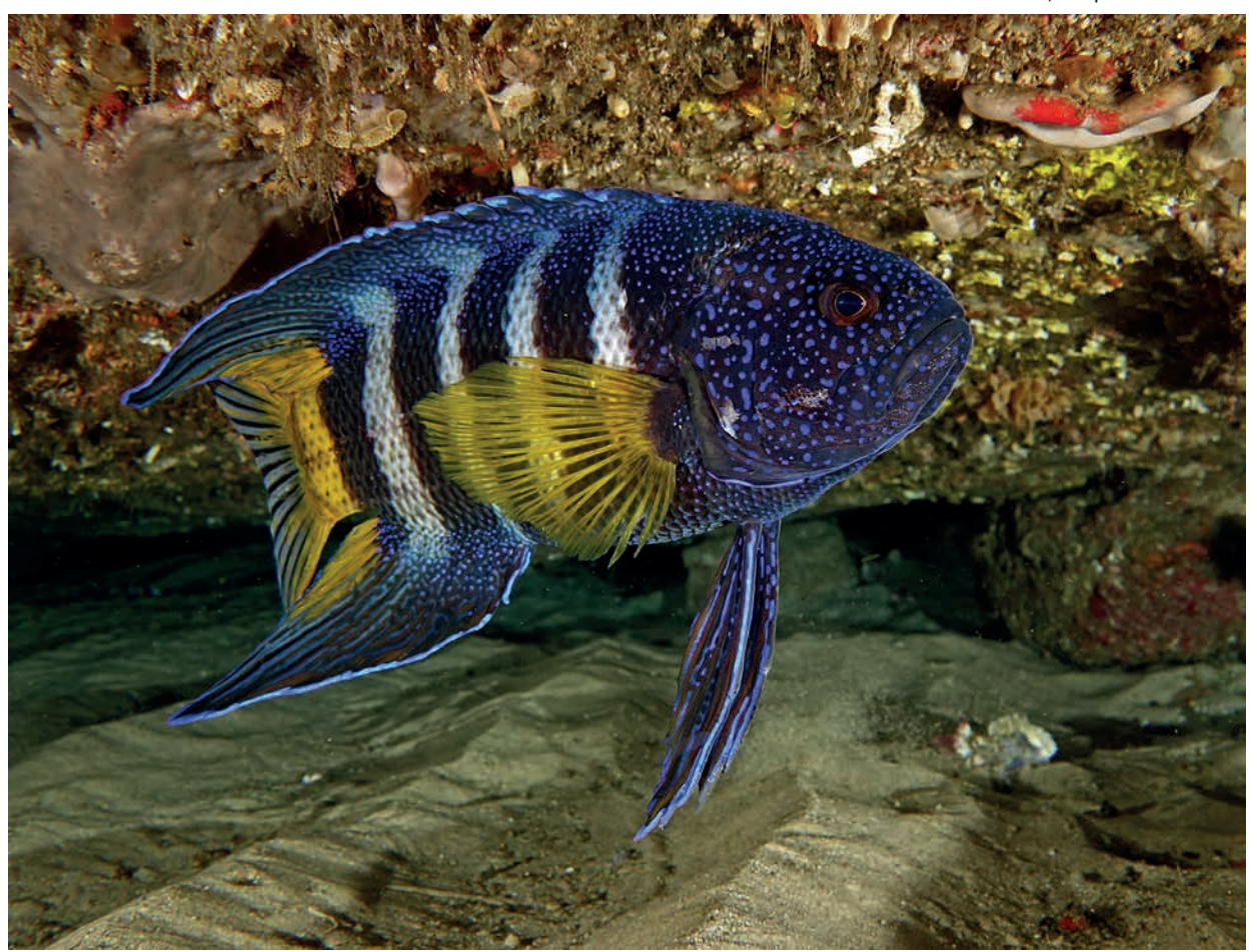
Figure 2: The eastern blue devil (Paraplesiops bleekeri) is a temperate cave-associated species that would not look out of place on a tropical reef. Brightly coloured and a prize sighting for divers; they are protected in New South Wales (Australia) waters because of their natural rarity and low abundance.

We know of no historical records in Australian museums or databases of eastern blue devil fish from deeper than 30 m either. Owing to a combination of their protected status and the complex terrain they inhabit, commercial fishers are unlikely to come across them, as trawling is avoided on these areas because of the risk of damage to nets. The vast majority of sightings and records of eastern blue devil fish are reported from divers and researchers. The accepted depth range of eastern blue devil fish and many coastal reef fish coincides with the recreational dive limits of ~30 m, despite the fact that