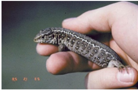
FIGURE 1 Female sand lizard ( Lacerta agilis )