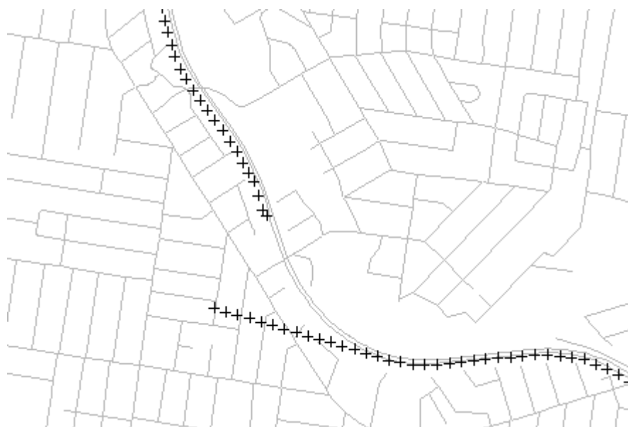
Figure 2 Example of straight-line drift, where a GPS receiver has lost its accuracy. The GPS continues to record locations based on its last known speed and direction.