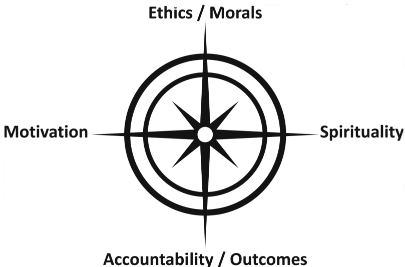
Figure 5.2 My moral compass.

These questions were used to develop the moral compass shown in Figure 5.2, which I drew up and kept in a prominent position in my study so that I would see it each time I sat down to work. It then guided my research process (Fejo-King 2013). Over time, the moral compass was refined to its current depiction as shown below.