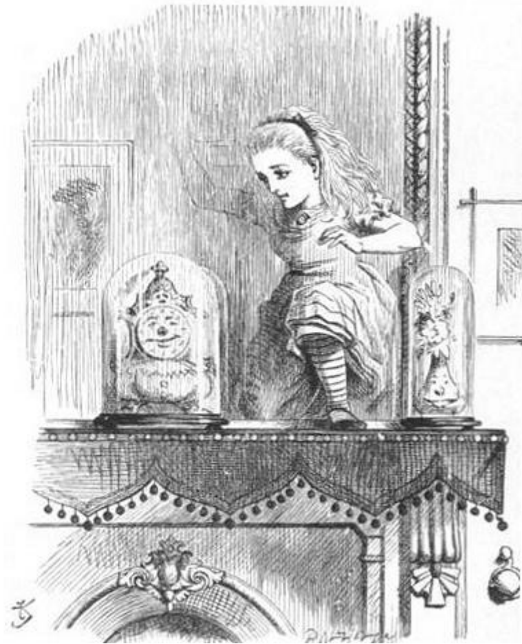
Through the looking glass