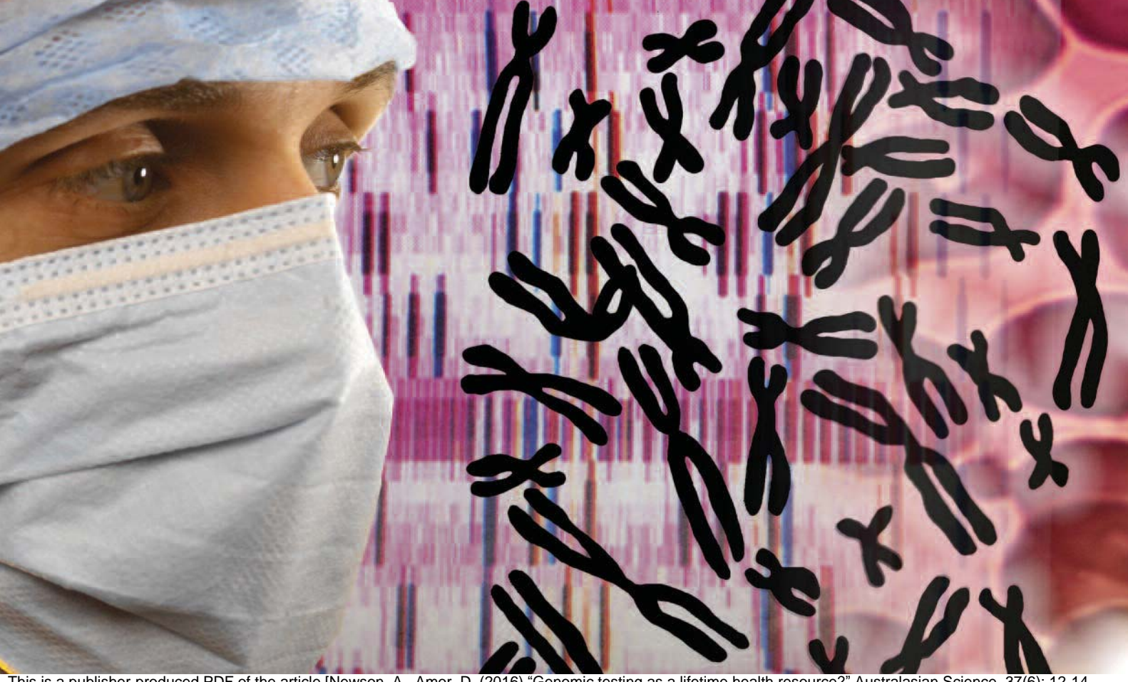
This is a publisher-produced PDF of the article [Newson, A., Amor, D. (2016) "Genomic testing as a lifetime health resource?" Australasian Science, 37(6): 12-14. July/Aug 2016, available online at http://www.australasianscience.com.au/article/issue-julyaugust-2016/genomic-testing-lifetime-health-resource.html], self-archived with permission, 2016.