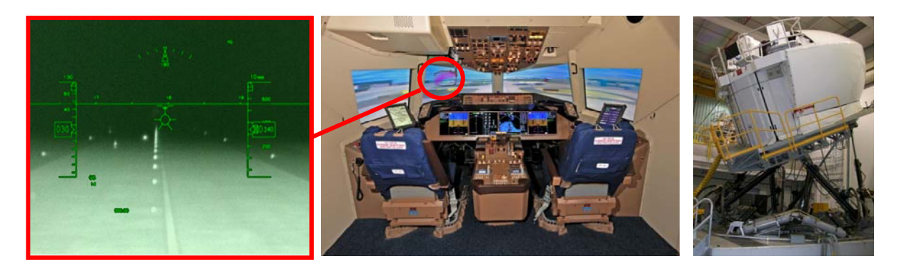
Figure 2. Full Motion-Based Commercial Aircraft Simulator (Enhanced Vision HUD shown)

The full-motion simulator (Figure 2) modeled a large commercial transport aircraft with typical weight and balance (approximately 180,000 pounds gross weight, 25% cg using 30,000 pounds fuel) and is configured to mimic the instrument panel of current state-of-the-art aircraft, with four 10.5" Vertical (V) by 13.25" Horizontal (H), 1280x1024 pixel resolution color displays tiled across the instrument panel. A collimated out-the-window (OTW) scene provided approximately 200 degrees horizontal by 40 degrees vertical FOV at 26 pixels per degree.