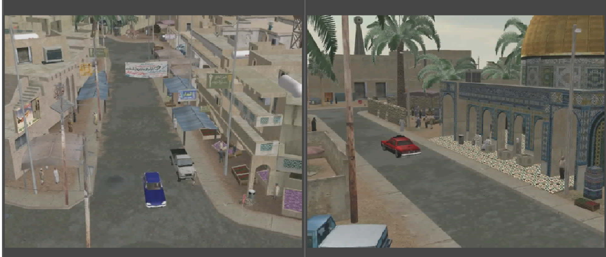
Figure 1. Displayed imagery as viewed by study participants.