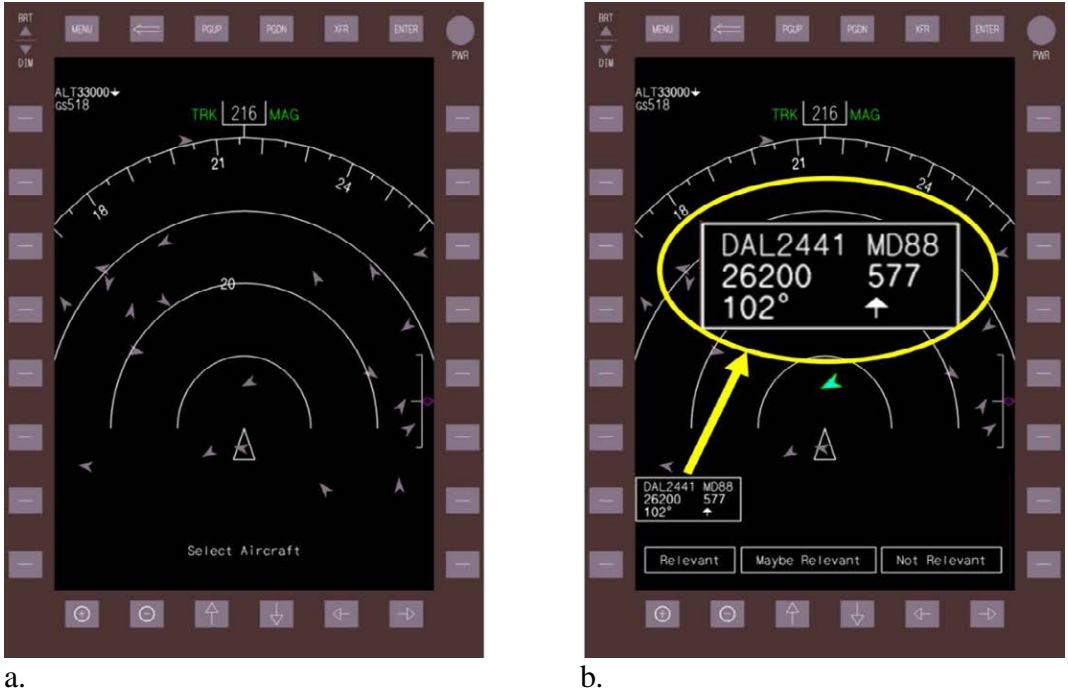
Figure 1. D.A.T.A. Screenshots

Thirty-one pilots, all current or recently retired with an Airline Transport Pilot rating, were asked to choose a relevancy (relevant, maybe relevant, or not relevant) for each selected aircraft. This was repeated for each aircraft and each scenario. Each pilot saw 36 scenarios with 20 aircraft per scenario. Over 22,000 data points, with their selected relevancies, were collected from the pilots to be used in training the TDM algorithm.