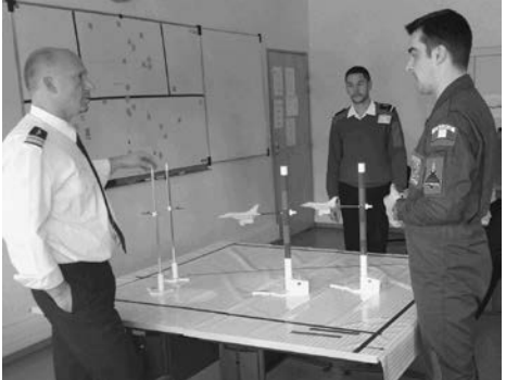
Figure 1 . The dynamic system simulation device with a pilot, an experimenter and an air traffic controller.

The experimental setup was presented to the pilot. He was asked to realize specific mission just as he was in his real cockpit, which means we expected him to apply the same uses as he does in flight. Then, the mission was briefed by himself as a real mission. It was the time to reveal his own tactical schemas. The tactical support and the Rafale models were designed to permit him to realize the same aircraft actions than those required in the real environment (Figure 1). He was told to limit his highly trained ability to anticipate because he would progress step by step in the mission simulated on a static simulation device. Each step included decisions and actions realized during about one minute. The fact that simulation is static at each step favored a better understanding of the tactical situation and allowed him to deeply analyze and speak out his thoughts and actions to come. The main objective was to lead the pilot to identify the information needed in the HSI to act. Because the pilot is focused on his actions, available but not required current information should not be evoked and led us to a pure list of useful information.