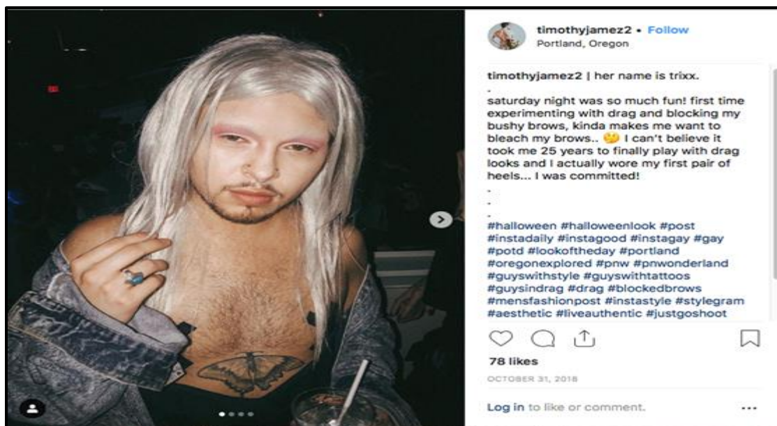
Figure 2. Nichols, T. (2018). Person wearing wig holding drink [Photograph]. Retrieved from https://www.instagram.com/p/BpnB94Kln2a/