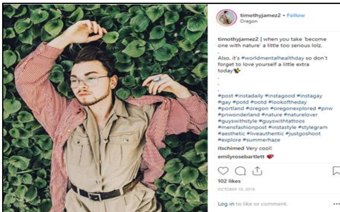
Figure 1. Nichols, T. (2018). Person lying in bed of plants. [Photograph]. Retrieved from https://www.instagram.com/p/BoxhFFohFbI/