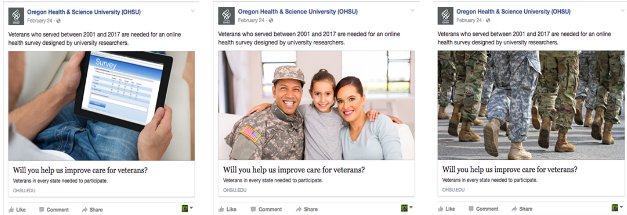
Figure 1. Sample Facebook ads illustrating the three different ad images (Survey-Taking, Family, and Soldiers Marching).

Specific approaches that can motivate research participation include: targeting feelings of altruism or a “warm-glow” effect [23], harnessing “psychological capital”, which is closely correlated with a sense of empowerment [24,25], or using a statement of what others in similar situations do, also known as descriptive social norms [26]. Providing financial incentives [27] or encouraging the sharing of content with social network members could also increase engagement [28]. Based on these ideas, we crafted and used the following 5 ad headlines: