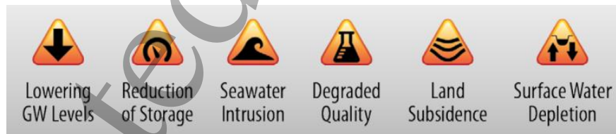
Figure 2: Undesirable results to be avoided under SGMA.

SGMA also is compelling the creation of new agencies, regulations, guidance, decision-making processes, and institutional relationships, all of which will need to address groundwater-surface water interactions (among other matters). New local groundwater sustainability agencies (GSAs) must develop and implement groundwater sustainability plans (GSPs) for groundwater basins prioritized by the California Department of Water Resources (DWR) [47]. GSPs must demonstrate how GSAs will manage groundwater to avoid undesirable depletions of surface water. SGMA also requires DWR to develop groundwater regulations, provide technical assistance, and review the sufficiency of GSPs [48]. The SWRCB is responsible for intervening, and potentially taking over management, in a groundwater basin if the two agencies deem a GSP or its implementation insufficient [49]. Both state agencies thus have significant new roles in groundwater regulation; they are no longer limited to their traditional surface water domains.