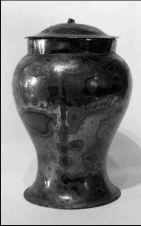
A MR. TUTTLE found this small silver jar near the likely Spanish shipwreck site at low tide in the late nineteenth century. It was probably used by priests for holding holy oil and is part of the Tillamook County Pioneer Museum's permanent collection.