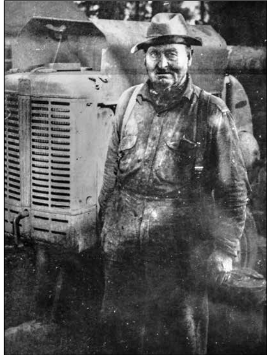
OHS digital no. hbor16996

Treasure-seeking on the actual beach presented additional conflicts in an area heavily used for public recreation. In 1967, Mareno used a tractor bulldozer