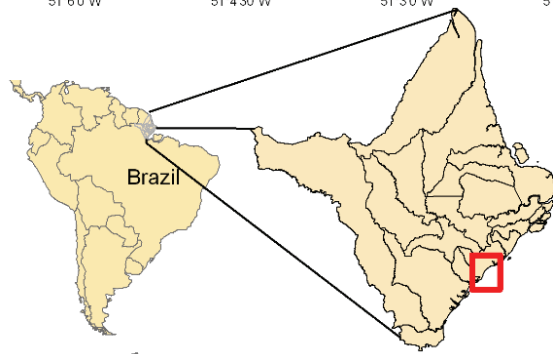
Figure 1. Collection site of the Loricariidae species in Igarapé Fortaleza basin in the Amapá Satate (Brazil).